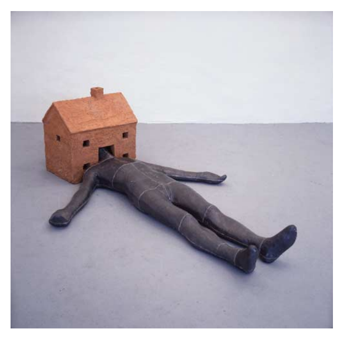
Figure 4 | Antony Gormley, Home , 1984. Lead, terracotta, plaster and fibreglass; 65 x 220 × 110 cm. Reproduced with permission of the Gallery Hufkens Brussels. This figure is not covered by the Creative Commons Attribution 4.0 International License. Copyright: the artist.