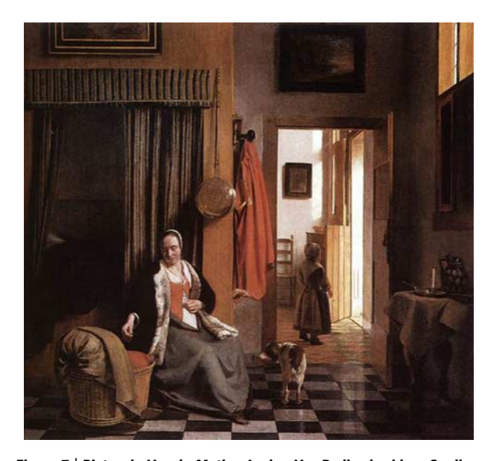
Figure 7 | Pieter de Hooch, Mother Lacing Her Bodice beside a Cradle, 1659-60, Oil on canvas, 92 x 100 cm, Staatliche Museen, Berlin. This figure is reproduced under the terms of fair use for academic purposes. The image is not covered by the Creative Commons Attribution 4.0 International License.

philosophical inquiry into the relationship between interiority and exteriority, between subjectivity and objectivity. Gormley's sculpture (Fig. 4) of a supine body with a model house over his head is an unexpectedly direct portrayal of the innermost "spatial and physical awareness" described by Paul Valéry in his Story of my Little House : "I was maybe six, maybe eight years old. I went under the sheets, pulled my head and arms out of my long nightgown and, turning myself into a bag, I squeezed myself inside, like a foetus. I hugged my chest—and repeated to myself: my little house... my little house. " <sup>22</sup>