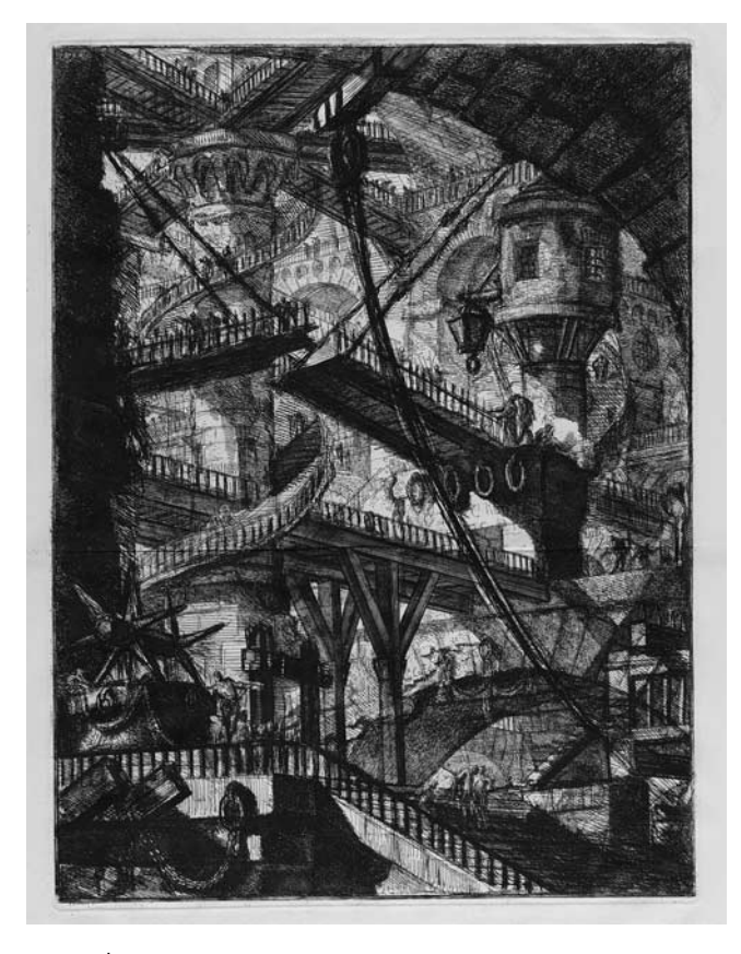
Figure 3 | Giovanni Battista Piranesi, Carceri d'invenzione, VII: The Drawbridge (1750). This figure is not covered by the Creative Commons Attribution 4.0 International License.