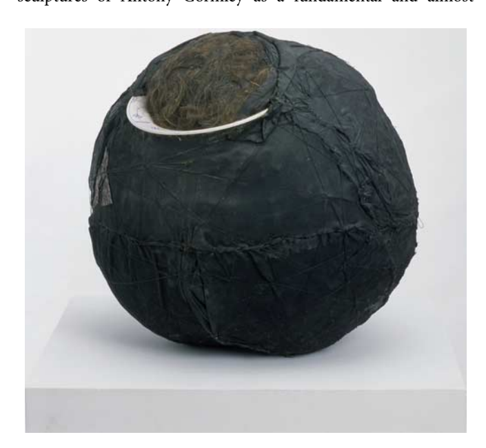
Figure 2 | Thierry De Cordier, Gargantua , 1996, 40 × 45 cm. Collectie Ministerie Van De Vlaamse Gemeenschap; Foto: Dirk Pauwels/SMAK. Reproduced with permission of the Gallery Hufkens Brussels. This figure is not covered by the Creative Commons Attribution 4.0 International License. Copyright: the artist.

Coda. Where is someone most (with) "oneself"? One can read the sculptures of Antony Gormley as a fundamental and almost