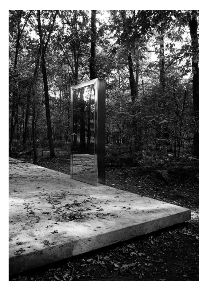
Figure 1 | Richard Venlet, Open Room Integration , Huize Monnikenheide, Zoersel 2006. Reproduced with permission of the artist. This figure is not covered by Creative Commons Attribution 4.0 International License. Copyright: the artist.