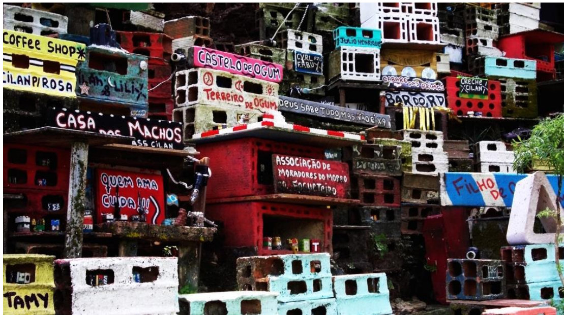
Morrinho Project, Rio de Janeiro