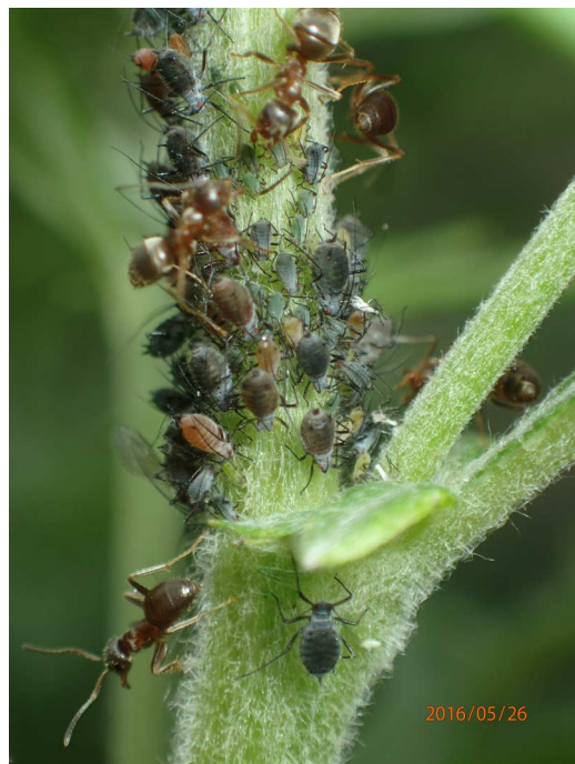
Fig. 1. Color polymorphism in M. yomogicola and attending ant, L. japonicus . Large black aphids and small green ones are green morphs, whereas large and small orange and brown ones are red morphs.

Here, we investigated a color polymorphic mugwort aphid ( Macrosiphoniella yomogicola ; Fig. 1) that is attended by ants. Because ants attend this species, M. yomogicola should not experience strong predator-mediated selection. Thus, the coexistence of the two color morphs in this species cannot be explained by frequency-dependent predation. We should also note that the two color morphs cohabit sympatrically on a mugwort shoot (Fig. 1). This means that the balancing selection of two opposing selection pressures is not likely to explain this polymorphism, because the environmental heterogeneity that is required to maintain this type of polymorphism is unlikely to take place. Polymorphism by overdominance is also unlikely in this case, because the two color morphs reproduce parthenogenetically during the observed spring-summer seasons. Therefore, the former three hypotheses are not likely to explain the color polymorphism in M. yomogicola . Thus, we hypothesized that the color polymorphism in M. yomogicola is maintained by the attending ants because they prefer aphid colonies with a specific ratio of the two morphs. To test this hypothesis, we measured the preference of the ants to the aphid colonies with different proportions of the two morphs. We initially evaluated the effects of attending ants on the survival of the aphid colonies by experimental removal of the ants. We show that the attending ants are necessary for the persistence of the colony. We then