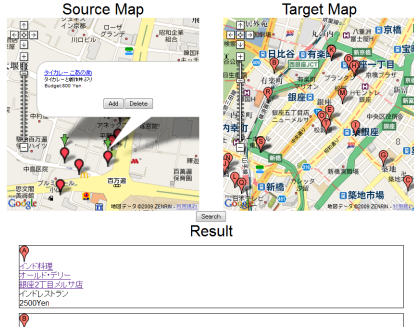
Figure 1: Query-by-example interface for geographic object search.

$40-meal, and the other Japanese for a $40-meal, can be either close or far by focusing on the prices or styles. Attributes that are focused on vary by user. Thus, the adaptive distance metric should be considered, which gives weight to important dimensions in the distance calculation.