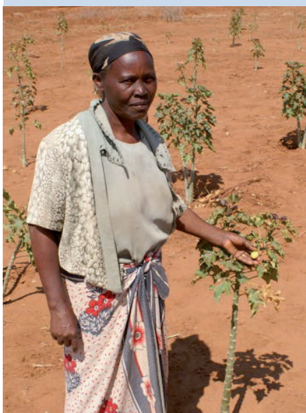
Figure 1: Kenyan farmer in Kibwezi showing her one year old jatropha plantation. Growth rate is low and carbon sequestration potential is limited.