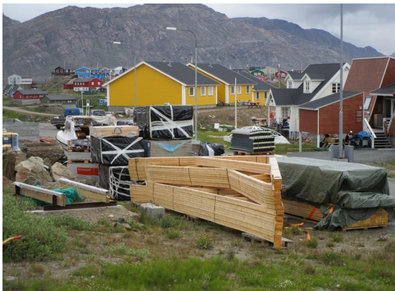
A Panbo house kit for a single-family house, delivered on site in Sisimiut.

There might be a tendency that in Nuuk more houses are individually designed by architects than in the rest of the country. There are only few architects outside Nuuk, and small projects cannot bear the costs of travelling.