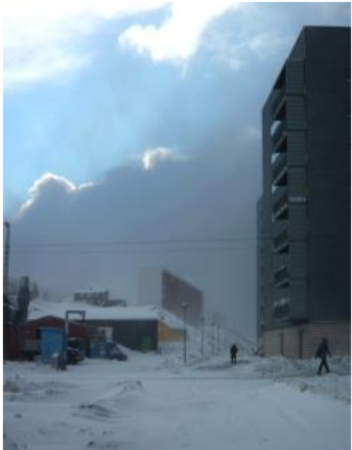
Downtown Nuuk in a blizzard. There is no tradition for planning according to wind, snow and ice drifts in urban surroundings.

On the other hand, a different context can sharpen the analysis and especially the awareness of factors, that under other circumstances would be taken for granted.