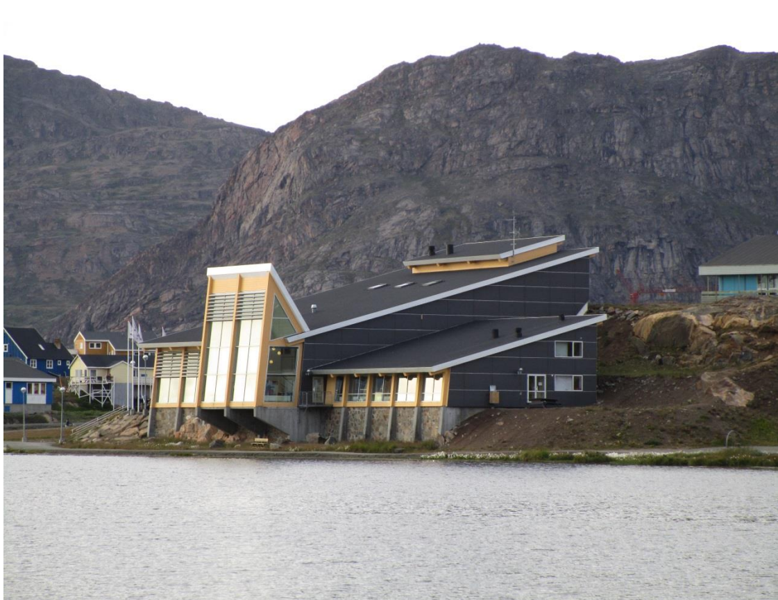
The Taseralik House of Culture in Sisimiut with large windows facing south – and overheating in the summer and cold drafts in the winter.

In a school in Ilulissat, the class rooms in the new wing cannot be used when the sun is shining in the summer xix . In Sisimiut, the director of the cultural house Taseralik hopes for cloudy weather when having events in the building.