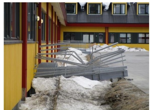
Photos from the SANA hospital in Nuuk, taken in the February (left) and in May. The pictures show how a heavy layer of ice is built up under the snow during the winter. This layer can obtain a considerable thickness with very large icicles. The picture from May shows what can happen by the thaw, when such an icicle and block of ice break loose and fall on a staircase / ramp. Besides being a danger to the surroundings the massive ice means a risk of damage to the roof and deformation of the overhang.