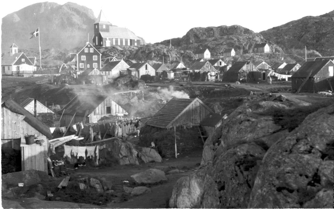
Housing in Sisimiut in the 1930's.

The first generations of these homes were the small wooden houses which have become the spitting image of Greenlandic settlements. They were very well planned and designed by the Greenland Technical Organization (GTO). The materials were shipped in containers and Danish craftsmen came up in the summer to build the houses, as Greenlanders were not supposed to take part in the building process. They were to remain hunters and fishermen. (The first carpenter was educated in Greenland as late as in the beginning of the 70's).