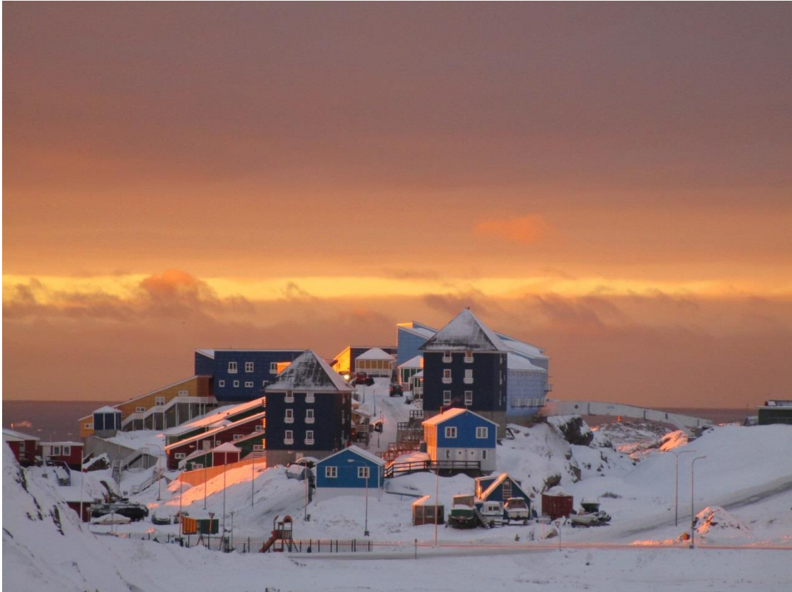
This estate in Sisimiut is one of the few designed for the spot it is built on.

In 2005, Selvstyret decided to develop a tower block as the new public housing concept, inspired by Icelandic construction. The first seven 8-storey blocks with 210 apartments were risen in Tuapannguit in Nuuk in 2007-11, and since then more of these blocks has been built in Nuuk (i.e. Qinnngorput) as well as in some of the larger towns. Some of them up to 10-storeys, some as “low high-rise” in 3 storeys.