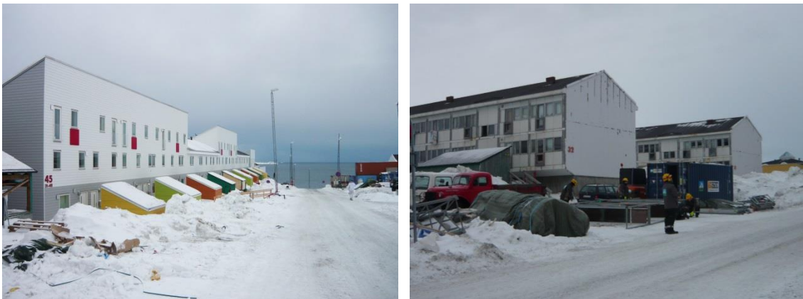
Contrasts on Radoffeldet in Nuuk. Terraced houses built in the 1970's. To the left a block thoroughly renovated in 2013, to the right blocks that are still waiting on their turn.

The Greenlandic government has decided to give priority to refurbishment rather than to new construction in the years to come. There is a tremendous need for refurbishment, as there is no tradition for maintenance. Therefore most houses that are more than 20-30 years old, are in a rather bad shape. iii The contradiction to this is the shortage of homes in Nuuk as well as other settlements with increasing activity.