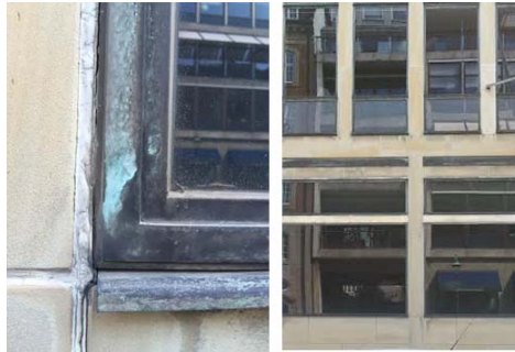
Figure 6: Problems in sealing materials in some parts of the facades.

establishing the position of structural elements and for defining the size and of these elements, Standardization, which is required for the use of prefabricated building avoid the errors that can happen when choosing the building components, Limitation of Components, which requested the repetition of basic dimensions. The advantage of the limitation of components is the high degree of standardization of information, prefabrication or fabrication in advance, is to produce building components for immediate or later use and assembly on a building site (J. Plante) [18].