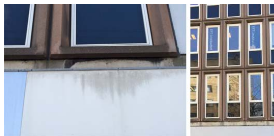
Figure 5: Problems like mould in the façade.

There are a number of technical criteria for this industrialized process that can be summarized as: Modular Coordination based on arbitrary dimensions for