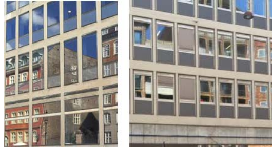
Figure 4: Some of the new cladding materials like metal and dark glass.

Generally, most of the prefabricated office buildings of the sixties and seventies were without their own identity as outstanding or spectacular buildings. In the following decades companies have started to have several demands regarding how the building should reflect the image and the culture of the company. The tendency has moved towards 'built to suit'. With 'built to suit' the company, through the design, can influence the signals that the building sends out. The property companies, contractors and architects try hard to fulfil these needs despite the buildings generally having a traditional prefabricated building as a base, trying to achieve the demands of the companies through different facade solutions (I. Garre) [20].