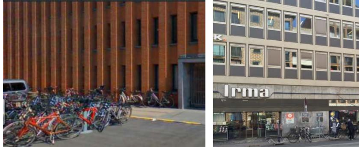
Figure 2: The repetition of similar squared or vertical elements of the facades.

featured horizontal lines and no holes in the facades and which bear only their own weight. Many facades are made of light constructions with continuous window strips and parapets, preferably based on fibre cement plate (A. Dragheim) [8]. The new facade components, such as curtain walls and glass, have aesthetic qualities which are expressed through the concept of surface of volume. The aesthetic principle of surface of volume has been derived from the fact that such architecture has no solid supporting facade walls.