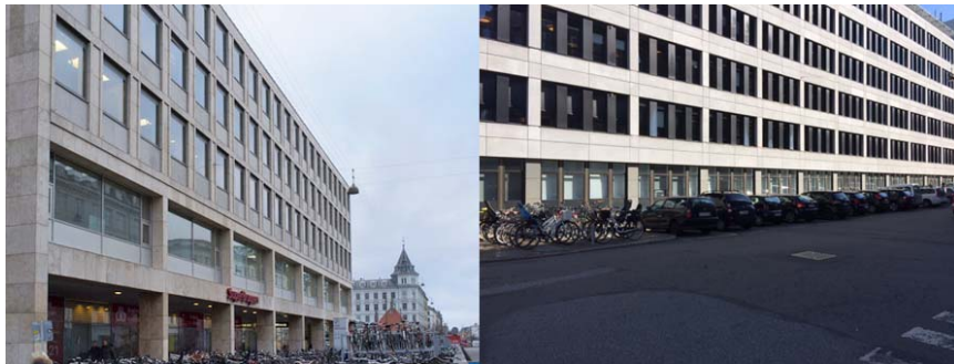
Figure 1: Concrete facades will often be dominated by white or light grey colours.

Different structural systems were used in this period, for instance beams and columns or transverse bearing walls. This had its influence on facades that