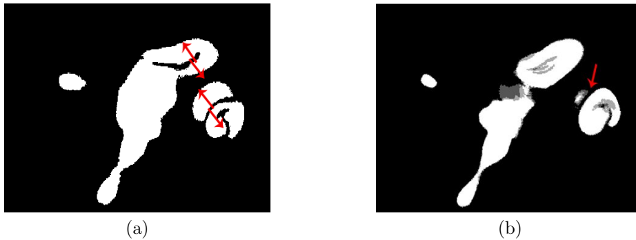
Figure 2. Leakage prevention. (a) Topology preservation where the red arrows indicate that the unit normal vectors of the corresponding points are pointing in opposite direction. Thus, the contour is not allowed to evolve along these points. (b) Error control map prevents leakage, for example the red arrow shows that the contour in this area will not evolve and merge with the other turn of the cochlea and in case there was leakage in the error map in this area, both turns would not merge either, due to the topology preservation method.

Then, a final step of refinement is performed in order to refine the segmentation. The k is reduced to increase the influence of the region but the less contrasted areas will not be affected due to the topology preservation method which is computed using the unit outward normal vector of the contour. When two vectors are pointing in opposite directions, we will not consider it a safe position and these points will not be updated in the narrow band. A smoothing filter might be used such as sgolay filter to reduce noise. 16 In addition, we prevent the leakage in most cases using an error control map which will be considered in order to update the segmentation in the narrow band. To build the error control map, the training data images will be non-rigidly registered to the target image, then a sum of these registrations will be computed and it will be interpreted as a voting map where the positions with small number of "votes" mean that it might be an error in the registration, so below a threshold, we will not consider it a safe position and these points will not be updated in the narrow band. An example of topology and error control map is shown in Figure 2. Summing up, the refinement step applies the weights locally for regions and can be described as: