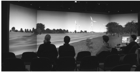
Figure 6: Site-specific visualisation from Zehner (2009)

static. For this reason, visualisations that only include still images are unable to fully capture the visual impact arising from the movement of the wind turbines' blades.