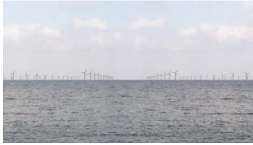
Figure 3: Generic offshore visualisation from Ladenburg and Dubgaard (2007) (cropped)

manner, the effects of the proposed alternatives are much clearer. This is the simplest approach that is capable of presenting actual visual impact changes to the respondents. As seen on the previous sections, it is possible to include various dimensions of attributes on the visualisation, as for example grouping, size, distance and number of turbines. Two important advantages are that its simplicity is reflected on ease of creation and lower cost; and the fact that by being generic it can be applied when referring to scenarios with indeterminate location or when doing cost-benefit analysis that has to be applied to a numerous amount of scenarios, making site-specificity infeasible.