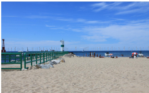
Figure 5: Site-specific visualisation from Knapp et al. (2013)

which can have a serious effect on the perception of the visual impact. Out of the reviewed studies, four utilise site-specific visualisations for presenting the visual attributes of the scenario. An example is shown in fig. 5