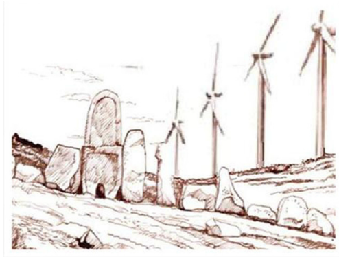
Figure 4: Non-scientific visualisation from Strazzer et al. (2012)

with hand drawn images. Though the wind turbines differ in size at the two visualisations, much is left for the respondents to imagine - particularly as one visualisation shows four turbines and the other five turbines. Though it is not possible to determine with complete certainty, it raises the concern that the visualisations are not correctly scaled and located, and therefore do not give an objective impression of the visual impacts. The same situation can be seen in the site specific visualisations, in which the turbines seem oddly large in the landscape (see fig. 4) and with varying numbers of turbines depending on the distance.