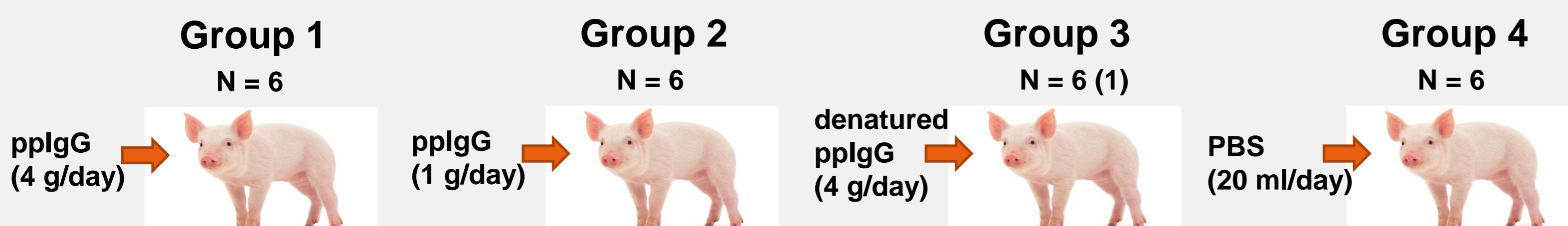
Figure 1: Weaner piglets were grouped according to treatment (see below) and observed for 15 days before they were euthanized. Different intestinal sections were emptied of faecal contents, and then and inspected for pathological changes.

A: Group 1 received daily 4 grams of multimerised ppIgG, Group 2 received 4 grams of ppIgG daily, Group 3 received daily 4 grams of denatured ppIgG, and Group 4 received daily 25 ml of PBS. Shortly into the study, two piglets (one in each group 1 and 4) became so ill they had to be euthanized. All piglets were euthanized at day 15.