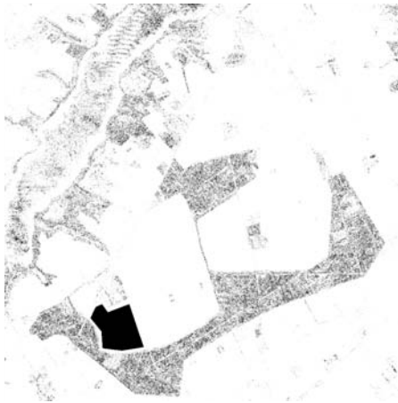
(b) p -value