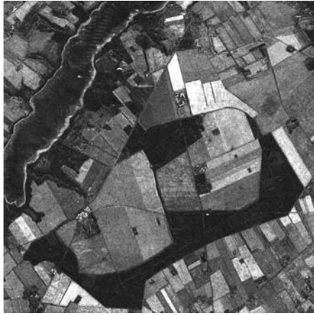
(a) -2\rho \ln Q