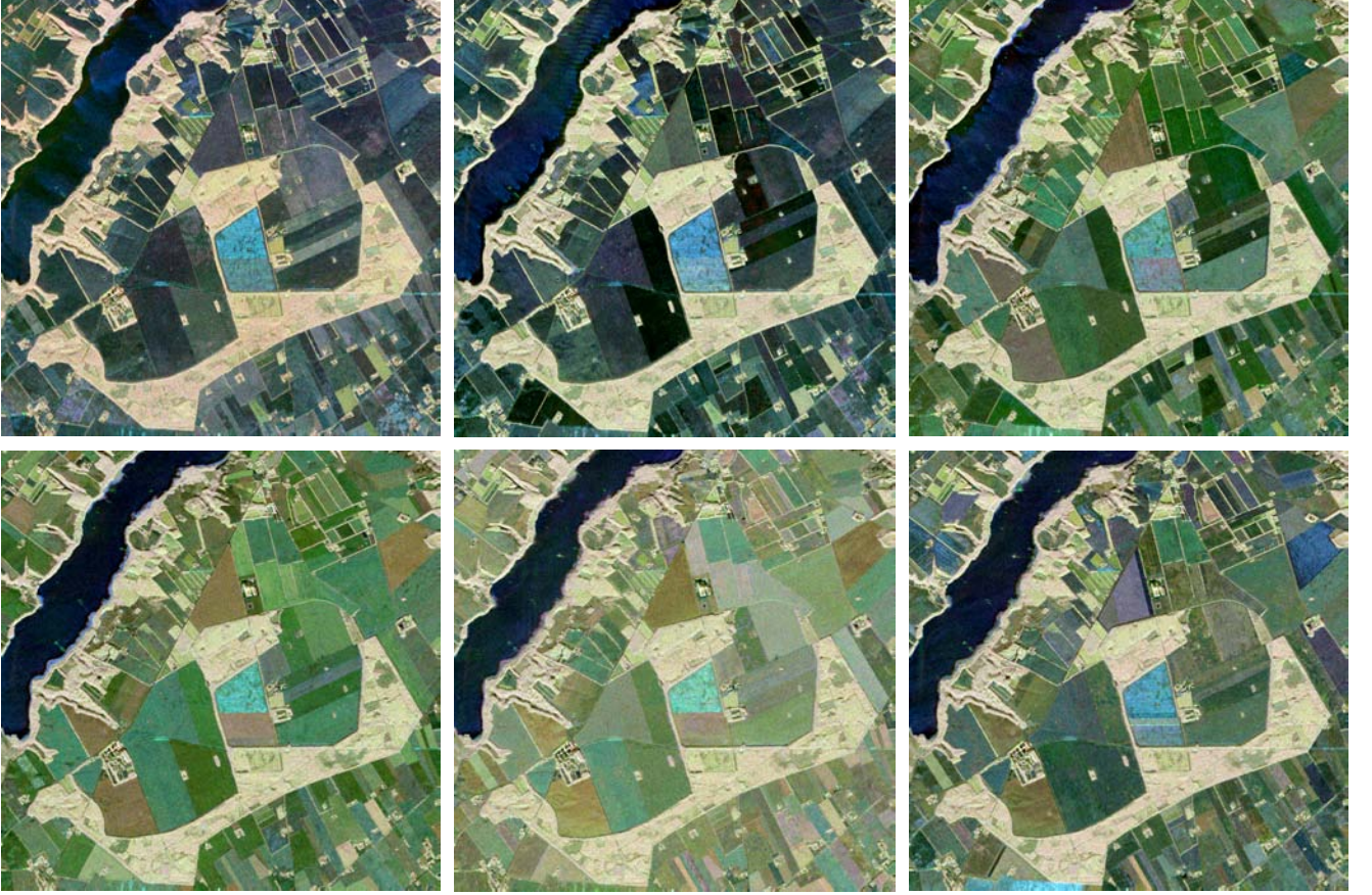
Fig. 1. RGB images of diagonal elements of the L-band data March, April, May (top row, left to right), June, July, August (bottom row, left to right).

For the logarithm of the test statistic we get