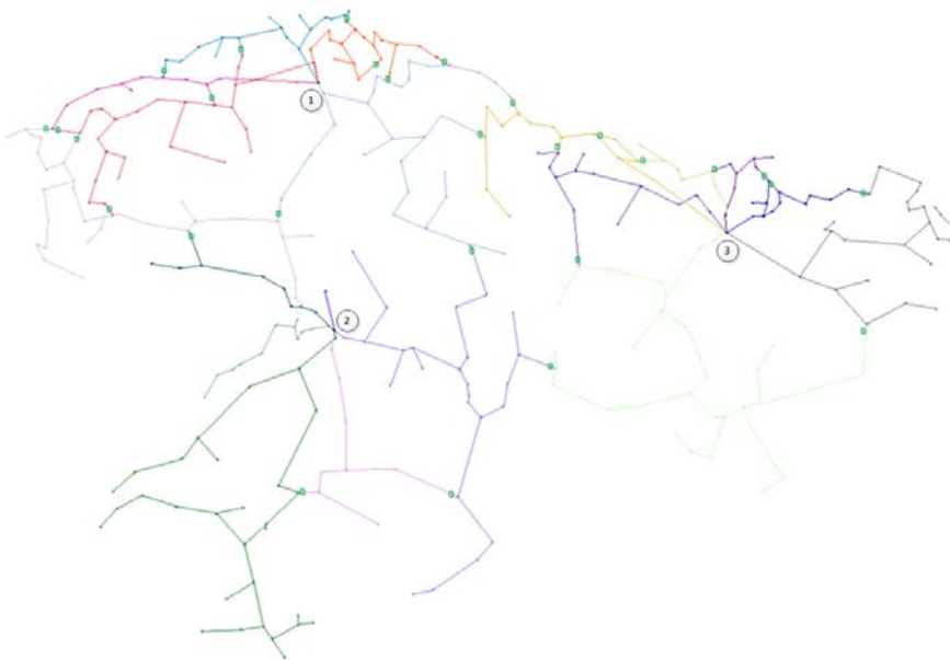
Fig. 2. Under-investigated 10 kV grid supplied by three primary substations with 28 normally-open switches