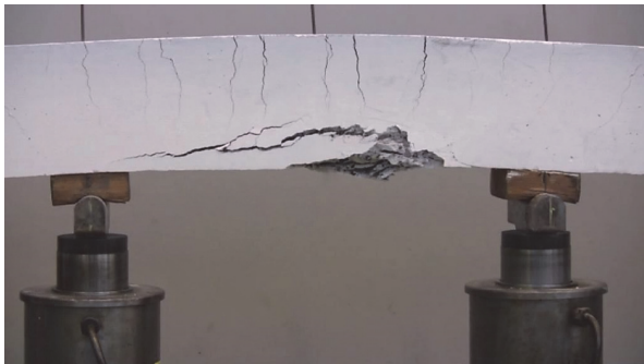
Figure 2 - Extracted frame from video of the beam testing in Figure 1 [2].