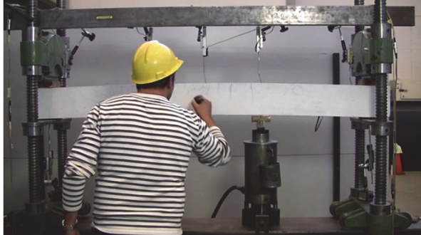
Figure 1 - Beam tested during a CDIO-project [2].