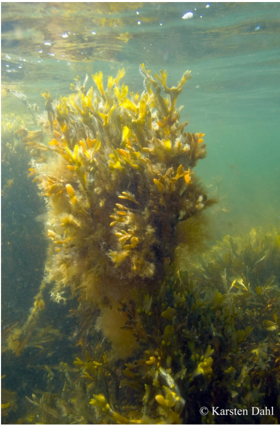
Figure 2a. Fucus community at 1½ m depth at Hellebæk north of Zealand.