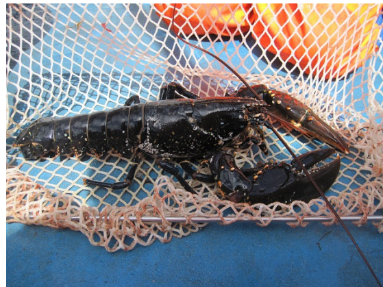
Figure 4b. Lobster.