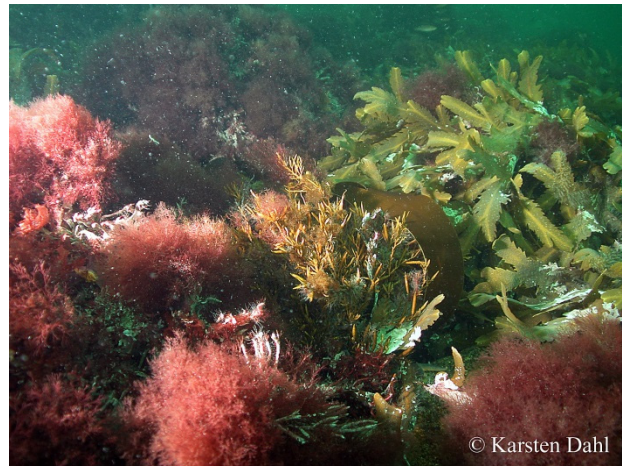
Figure 3b. Multi-layered algal community at 6 m depth from Briseis Flak in the southern part of Kattegat.