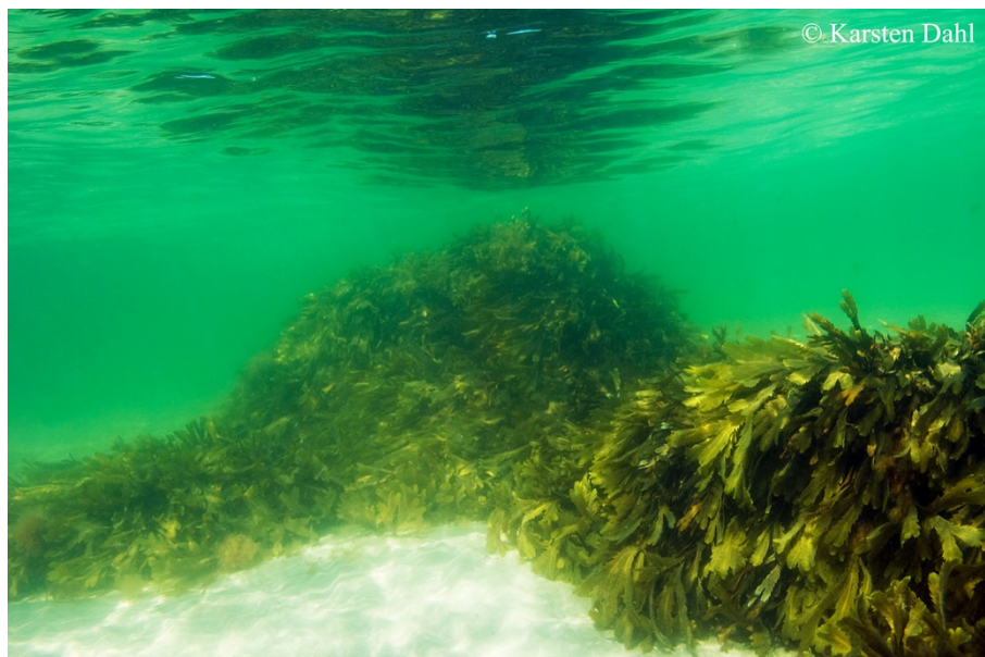
Figure 7. Algae on dispersed stones on sandy bottom close to Hornbæk Plantage.