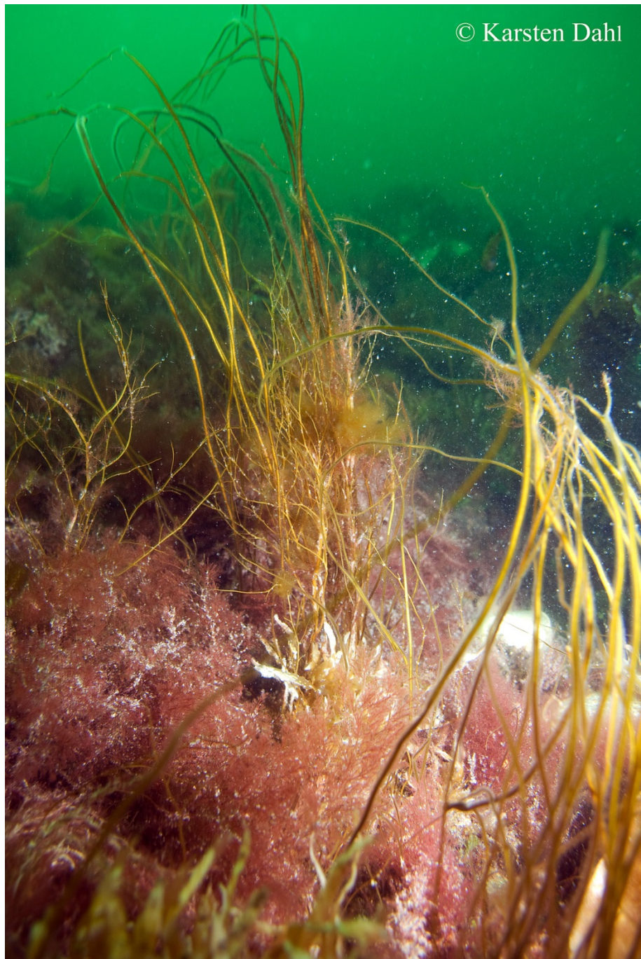
Figure 6. Algal community with typical opportunistic species. Dead man's rope (Strengetang) ( Chorda filum ) is a characteristic species for unstable bottom. Photo from Læsø Trindel at 6 m depth in 2007 before the restoration project.