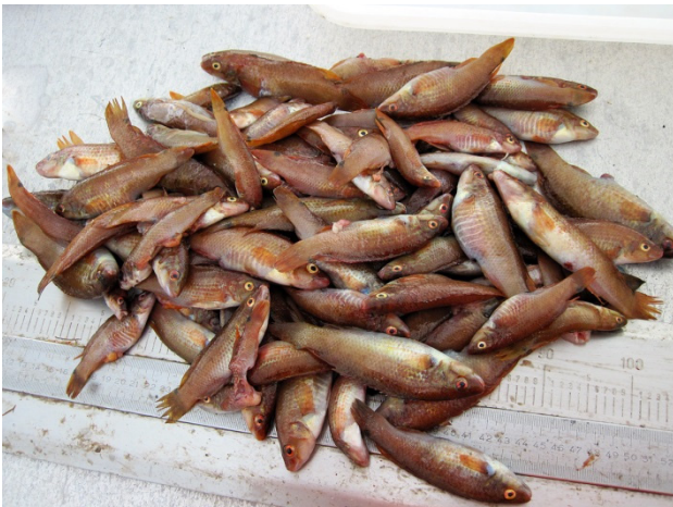
Figure 3a. Caught of Ballan wrasse.