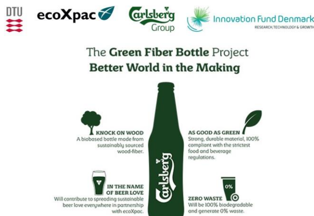
Figure 1: The Green Fiber Bottle project main features and research partners

The vision of the Green Fiber Bottle (GFB) project is to develop a paper bottle for beer, which will be both recyclable and biodegradable (Figure 1). The bottle is made out of paper pulp, which is a renewable resource. In order to enhance the green image of the product, the production technology has to offer the possibility of high-level energy saving.