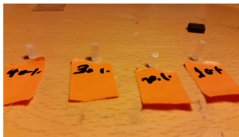
Figure 2. Preliminary test for solution concentration optimisation.

volumetric concentration of acetone. For 25 %, the diffusion was too slow as confirmed by the diffusion area, i.e. the ring around the holes, being very small. At higher concentrations of acetone the diffusion speed increased with increasing acetone concentration as expected.