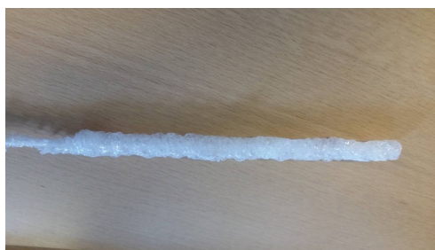
Figure 4. Bubble formation in a TOPAS cane after drying above 70 °C.

should be fairly limited. Figure 4 shows an example of what may happen during the drying process when the solvent content is too high.