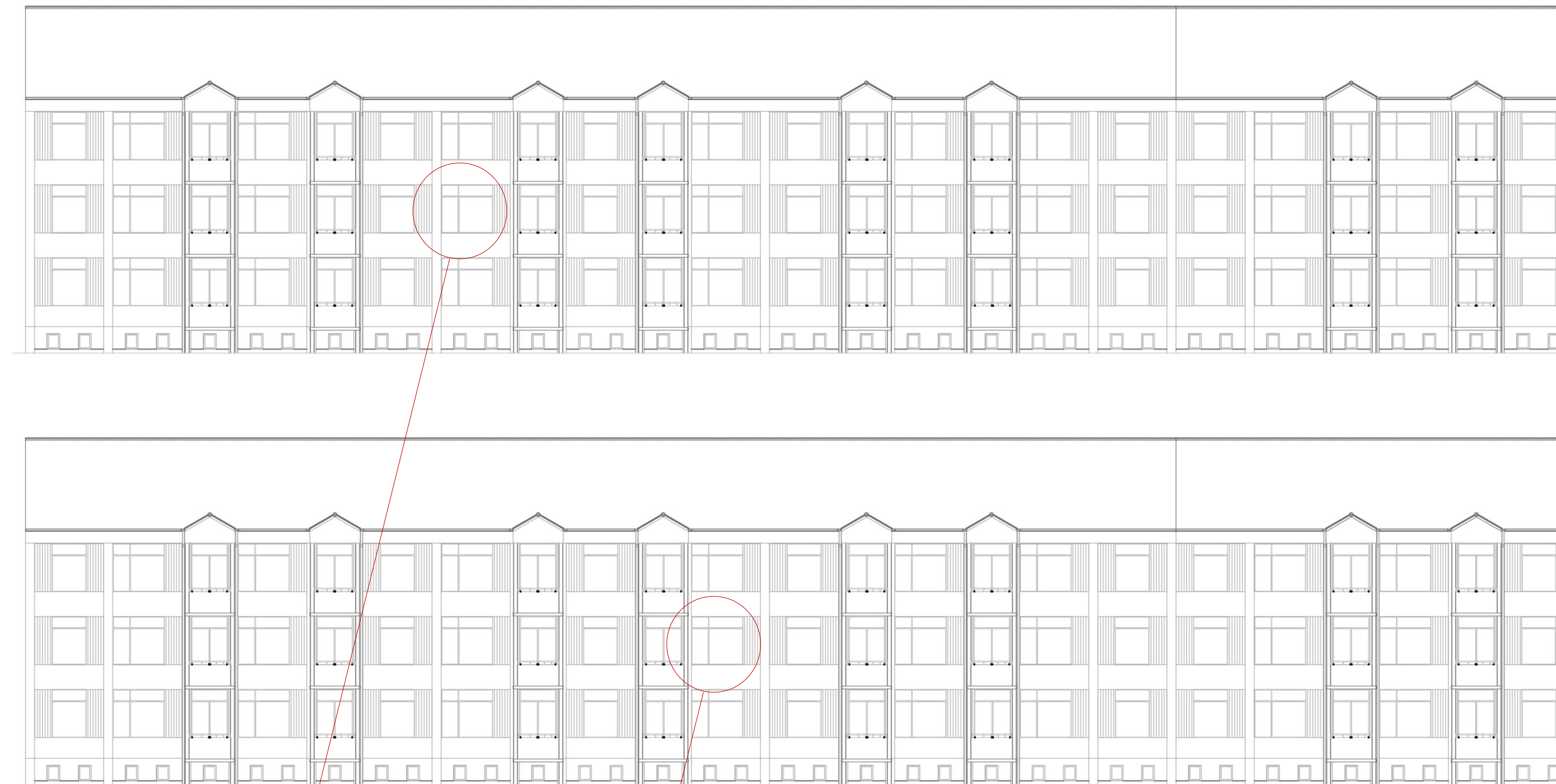
Fig. I. The Public Housing HAB, Haderslev, DENMARK, experimental block (top) and control block (bottom)

Funding from the Danish Energy Association (Dansk Energi PSO 348-018)