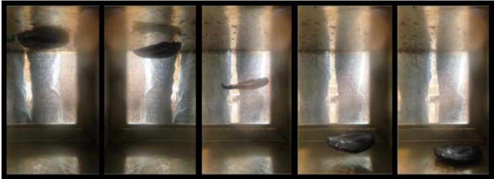
Figure 1: Illustration of the sinking of the residue after flame extinction for the burning of IF30, 40 mm initial thickness. Each picture illustrates approximately a time interval of 2 s.