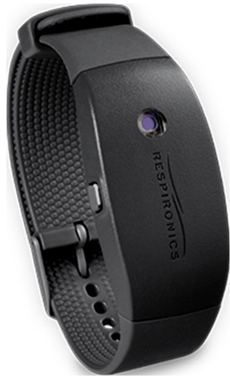
Fig. 1 Philips Actiwatch 2

Two measuring stations were used, one in the center of each side wall, to record the air temperature, relative humidity, and \text{CO}_2 concentration at 5-min intervals. No noise measurements were made inside or outside the room. A miniature data logger (HOBO U12-012) recorded the air temperature and relative humidity with an accuracy of \pm 0.35 K and \pm 2.5\% , respectively, and the signal from a \text{CO}_2 sensor (Vaisala GM20), calibrated for the range 0–5000 ppm, with an accuracy of \pm(2\% of range + 2\% of reading). The ventilation rates were calculated from the \text{CO}_2 concentration at steady-state and the \text{CO}_2 generation from each person, the latter based on an activity level of 0.7 MET (sleeping), a standard respiratory quotient of 0.83, and the DuBois body surface area of the subjects. The maximum \text{CO}_2 concentration during the night was used if no steady-state concentration was reached. Steady state was