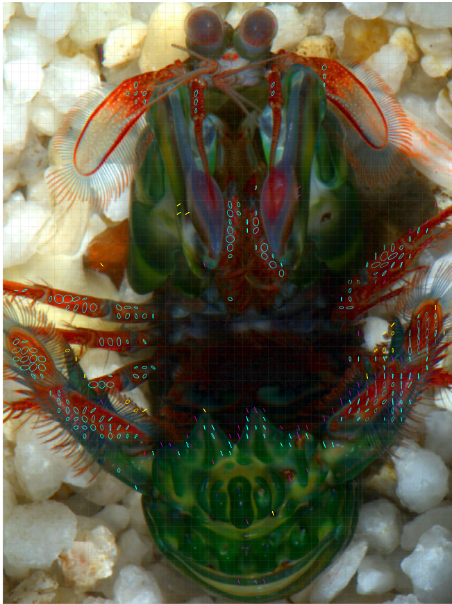
Fig. 3. Photopolarimetric data of the stomatopod Gonodactylaceus falcatus in a defensive position. Because most of the polarization is on the red portions of the head, legs and tail of the animal, the left-hand circularly polarized light is coded with red's complimentary colour, cyan; rare right-hand circularly polarized light is coded with yellow and linearly polarized light is magenta. The red colour in the image was overly saturated to better emphasize the correlation between the red pigmentation and the polarization (compare this figure with the traditional presentation of photopolarimetric data in Fig. S1).

polarized light reflecting from the beetle's sides in Fig. S3. Finally, directionality is only discernible when it is most relevant, i.e. when linear polarization is stronger than circular polarization. Notice how the radiating pattern of ellipses is visible at the periphery of the beetle's body in Fig. S3 while any such pattern is not as discernible in the centre of the beetle's body where the polarization is mostly circular.