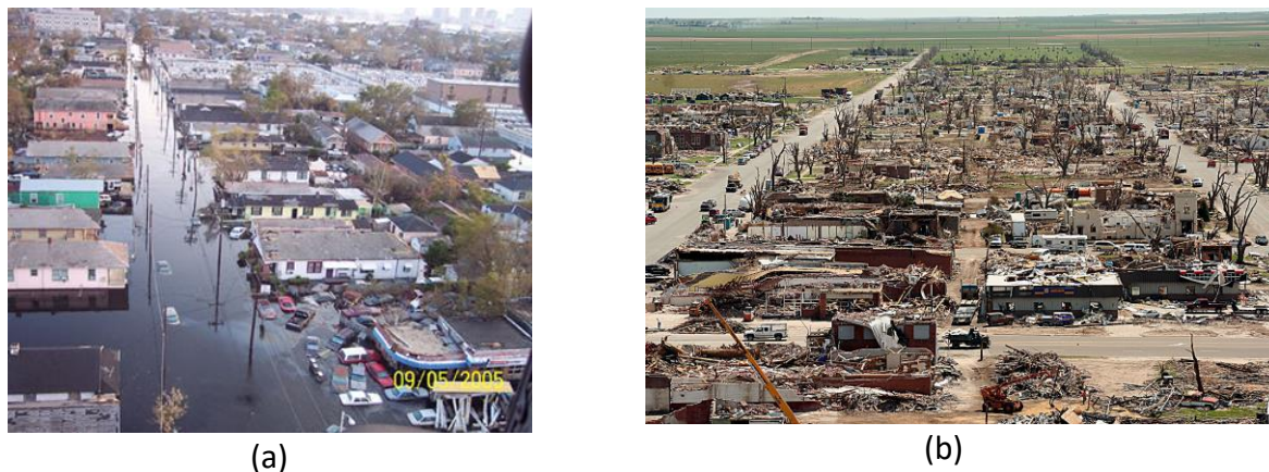
Figure 1 (a) New Orleans, LA during flooding following hurricane Katrina in 2005; (b) Greensburg, KS following the EF 5 tornado in 2007 which destroyed 95 % of the city

9 th ward. Conversely, communities may achieve a “new normal,” in which their community functions at a higher level following the event, in what has been termed a “build back better” scenario. An example of this is Greensburg, Kansas, USA following the 2007 EF5 (> 320 kph winds) tornado, in which 95 % of the city was destroyed as shown in Fig 1b.