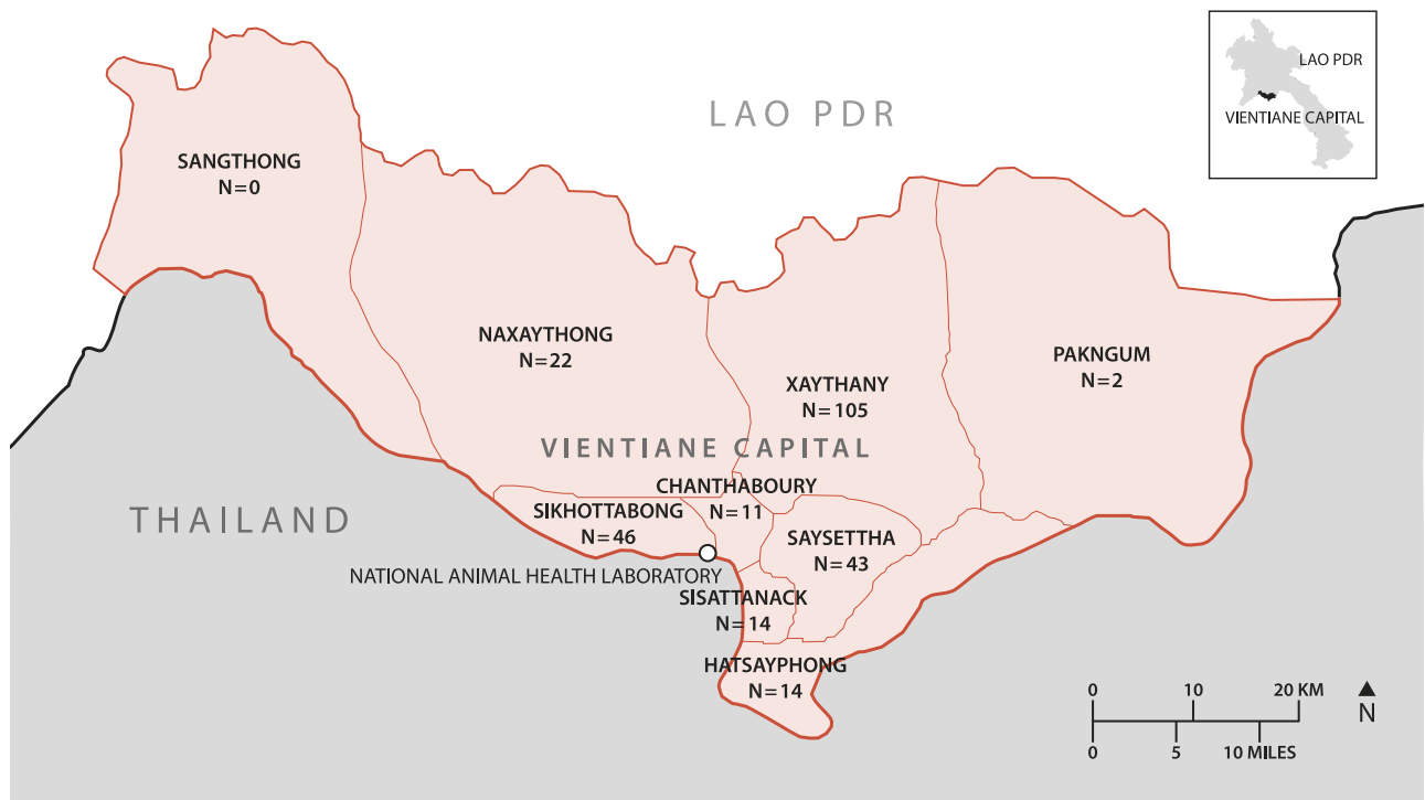
Fig 1. Map of Vientiane Capital indicating the number of rabies cases in each district in the period from 2010 to 2016.

https://doi.org/10.1371/journal.pntd.0005609.g001