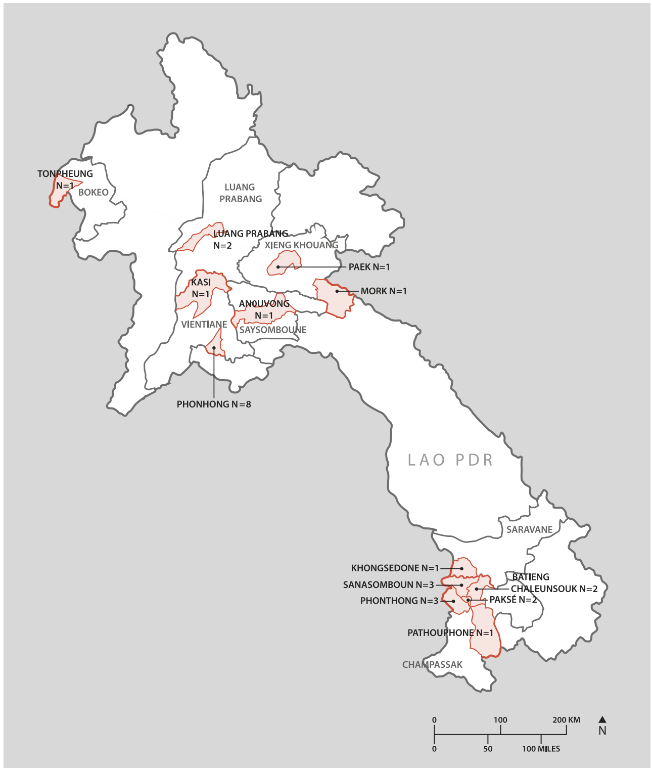
Fig 2. Map of Lao PDR indicating the number of rabies cases in each districts located outside of Vientiane Capital in the period from 2015 to 2016.

https://doi.org/10.1371/journal.pntd.0005609.g002