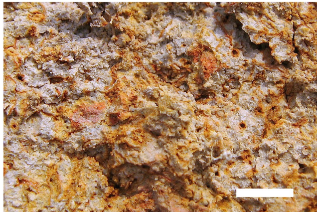
Figure 3. Close-up photograph of the typical soil structure in the subsoil horizons of the Ban Nabone site showing oxidized micro-domains (mostly along cracks and around root channels) in brown-red colours immediately adjacent to reduced micro-domains where greyish colours prevail. The white horizontal bar to the bottom right of the photograph represents 5 mm.

likely to have occurred in the liquid enrichment media, and may have accounted for the fact that enrichment cultures were frequently negative even when direct plating on solid media yielded B. pseudomallei . Remarkably, all quadrat/depth combinations but one yielded a negative culture at least once, suggesting that there were probably a number of false negative results. The enumeration of B. pseudomallei in soil samples using culture methods is also fraught with difficulty, and whilst we attempted this, as has been done in previous studies, we consider that the results should be treated with extreme caution.