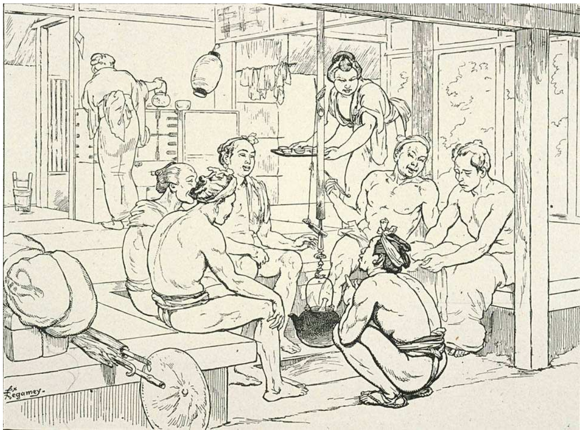
8.2 Félix Régamey, illustration of jinrikis at rest, in Promenades japonaises: Tokio-Nikko (Paris: G. Charpentier, 1880), 277. Image in the public domain.

[insert figs. 8.2 and 8.3 here—landscape]