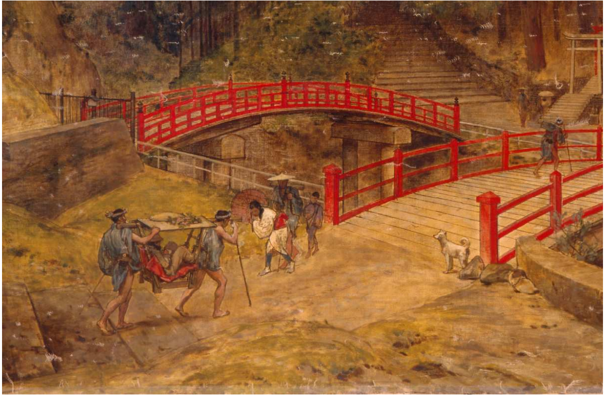
8.3 Félix Régamey, The Sacred Bridge and the Ordinary Bridge at Nikko , 1876-78, oil on canvas, dimensions unknown. Paris, Musée Guimet, MG 4796.

Yet contrary to stereotypes, the Eastern male in travel imagery was not always the passive feminine Other to Western virility. We see this in Régamey's representation of the porters at their meal: six men endowed with Olympian chests and limbs are displayed around a hearth, attended by two women (fig. 8.2). The figures and poses recall the académie , an exercise familiar to French artists. 77 And as in the académie no identification is necessary or desired. The emphasis on an idealized hyper-masculine physique shows the Japanese men as identical members of a team. The seated pair on the left is mirrored by the pair on the right; the