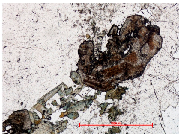
Figure 2. Cassiterite (brown) and tourmaline (blue-green) surrounded by quartz and K-feldspar in a Sn-only vein (PPL). Horizontal field of view c. 2 mm.