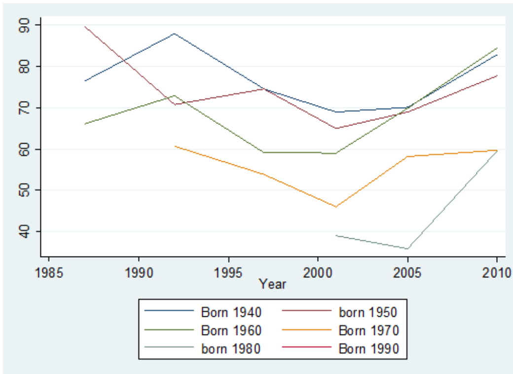
Figure 1: Estimated Turnout Changes by Age Cohort