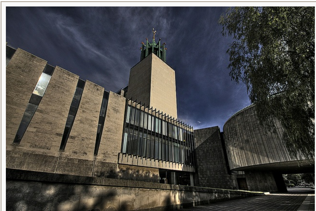
Newcastle City Council – an administration which once upon a time breeched ethical standards