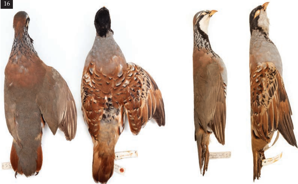
Figure 16. Specimen of Red-legged Partridge Alectoris rufa with a form of melanism that has changed the usual pattern and markings (left, NHMUK 1923.1.29.1) and a normal-coloured individual (right, NHMUK 1907.12.20.7); due to a mutation, the black head and throat markings are altered and the solid-coloured back, shoulders and wing feathers (based mainly on eumelanin) now exhibit distinctive patterns based on both melanin types, and some parts resemble the flanks plumage