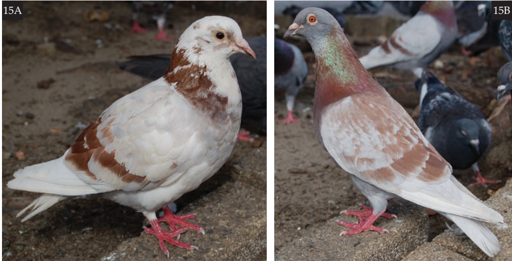
Figure 15. Feral Pigeons Columba livia with phaeomelanised plumage (ash-red) but different wing patterns: (A) Barred (the white primaries and head feathers are the product of leucism), (B) Chequer and (C) T-pattern chequer, Leiden, the Netherlands, 19 August 2007 (Hein van Grouw)

Thus, in some cases, colour morphs of a species may behave differently due to their respective physiological properties. Eventually, colour morphs may evolve into distinct taxa. An example of this is perhaps Carrion Crow vs. Hooded Crow. Besides differences in plumage (melanistic versus non-melanistic), they also differ in vocalisations and habitat selection, the latter especially during the breeding season (Rolando & Laiolo 1994). Nevertheless, in the areas of overlap they do interbreed and, although melanism in crows is probably based on more than one gene, the alleles for black appear dominant (pers. obs., based on colour of first-generation offspring and that of backcrosses to the parental species; Fig 6). Although Carrion Crow and Hooded Crow hybridise, pair composition is not random (Saino & Villa 1992, Rolando 1993, Risch & Andersen 1998). Also, hybrids prefer to breed with 'grey' crows rather than 'black' crows (Rolando & Laiolo 1994), which may suggest that the Hooded phenotype is the original colour. The preference for 'grey' may also explain the non-random pair formation in areas of overlap, if Hooded Crows only select a melanistic partner in the absence of their own phenotype. In general, reproductive success, defined as the number of chicks reared to about fledging, is greater in Carrion Crows than Hooded Crows (Saino & Villa 1992). This may reflect the fact that Carrion Crow is more aggressive (Saino & Scatizzi 1991) and more stress-resistant (Poelstra 2013).