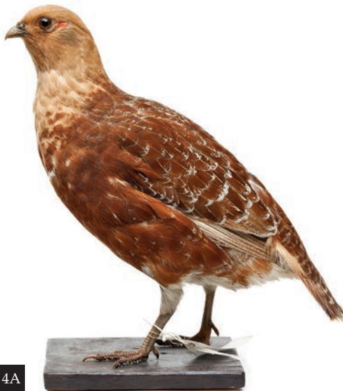
Figure 4. ' Perdix montana ', the phaeomelanistic variety of Grey Partridge P. perdix, NHMUK 1939.12.9.3717, Nasavad, Slovakia, 10 November 1932 (at left) and NHMUK 1939.12.9.3716, Norfolk, England, October 1911; the gene for this recessive mutation is present throughout the range of the species and is therefore a frequently recurring variety on the borderline of being recognised as a morph