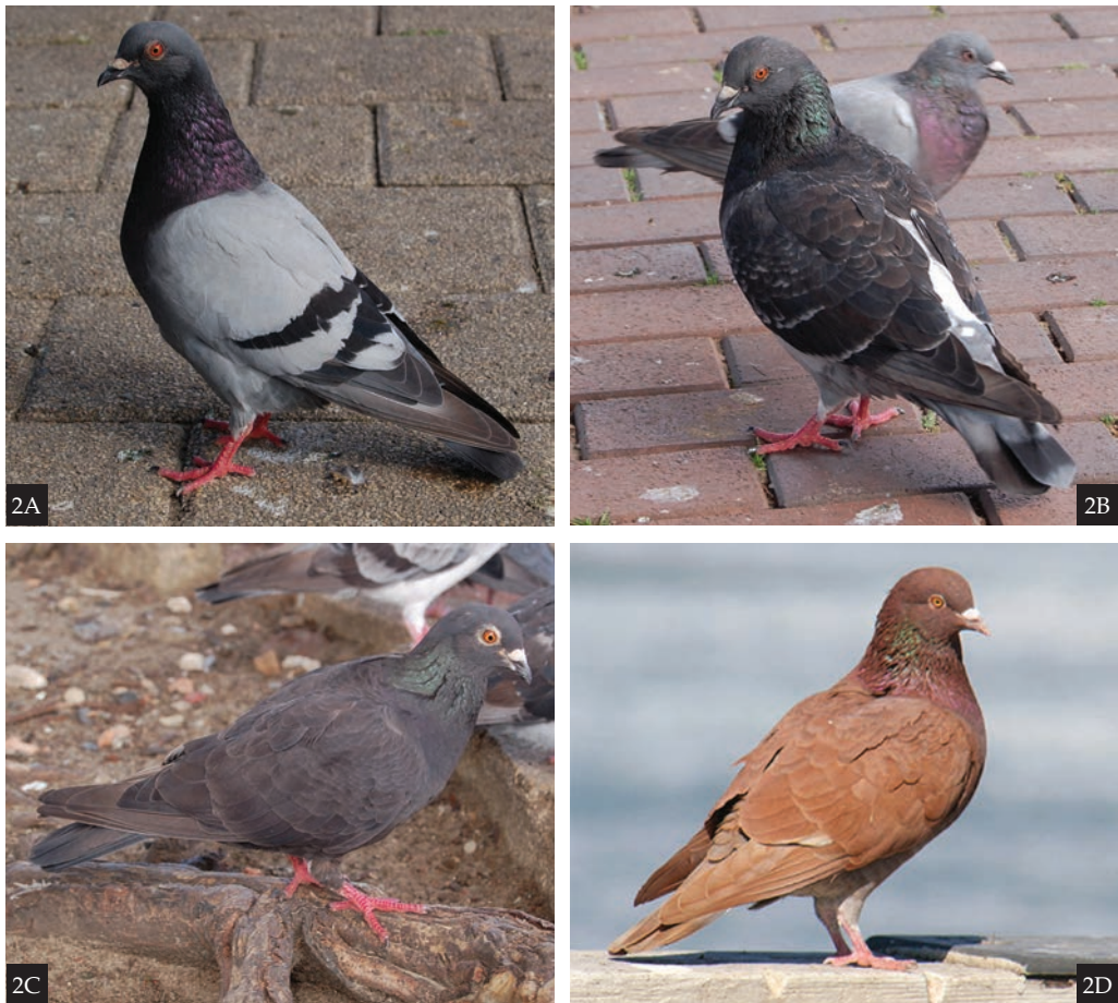
Figure 2. Feral Pigeons Columba livia : (A) wild phenotype, Leiden, the Netherlands, 19 August 2007; the grey wing-coverts and black wingbars are the result of different distribution of the same quantity of black melanin granules (Hein van Grouw); (B) T-pattern chequer, Leiden, the Netherlands, 19 August 2007; as a result of a dominant mutation of the pattern gene, the pigmentation over almost the entire wings is distributed as usually found only in the black wingbars, resulting in a blackish appearance, but the rump, tail and underparts are unaffected (Hein van Grouw); (C) Black, Leiden, the Netherlands, 19 August 2007; due to a dominant mutation known as 'spread', all pigment granules are equally spread, resulting in black plumage throughout (Hein van Grouw); (D) Recessive red, Pismo, California, USA; due to a recessive mutation of the extension gene that inactivates MC1R, pheomelanin alone is produced (Robert Shriner)

of this found in Common Quail Coturnix coturnix (Fig. 5) and Japanese Quail (Hiragaki et al. 2008). The eumelanistic morphs in different isolated populations of Chestnut-bellied Monarch Monarcha castaneiventris on the Solomon Islands are the result of two different mutations. The eumelanic plumage of birds on the small island of Santa Ana is the result of a variation of the MC1R, while equally black birds on two other small islands, Ugi and Three Sisters, possess a mutation of the agouti gene (Uy et al. 2016).