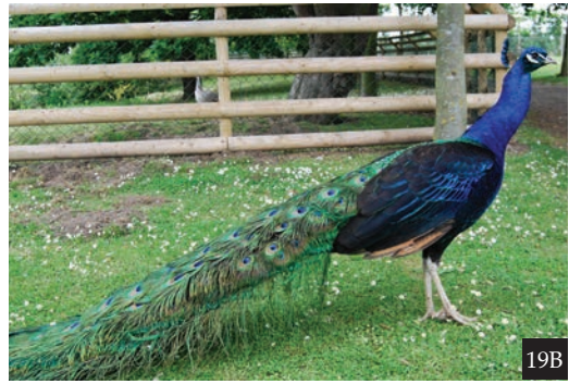
Figure 19. Normal-coloured and black-shouldered male Indian Peafowls Pavo cristatus ; apart from parts of the wing and shoulders, this mutation does not affect the rest of male plumage (Hein van Grouw)