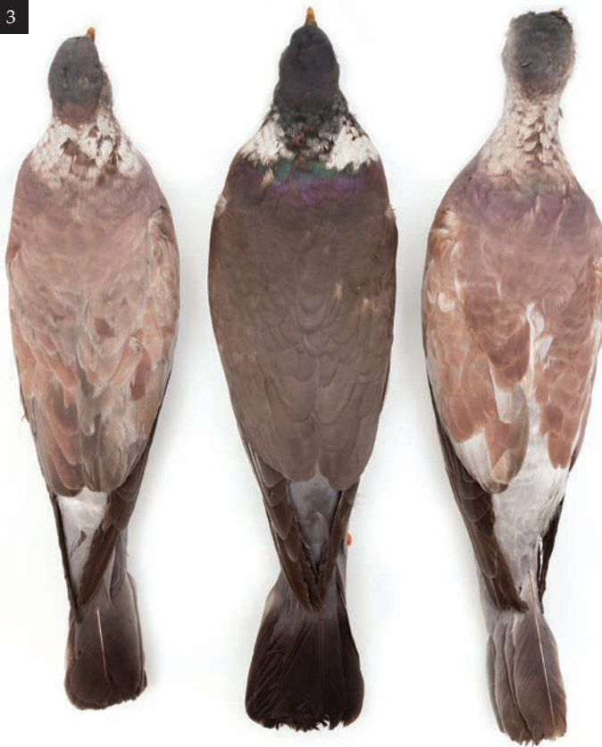
Figure 3. Common Woodpigeon Columba palumbus specimens (NHMUK 1930.8.14.1, NHMUK 2000.11.1, NHMUK 1923.3.8.1); the phaeomelanised plumage is probably the product of a similar mutation as 'recessive red' in Feral Pigeon C. livia (cf. Fig. 2D)