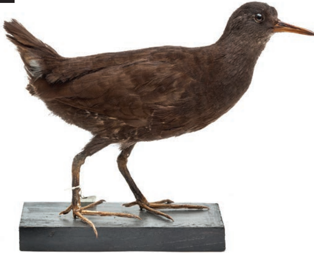
Figure 7. Melanistic Water Rail Rallus aquaticus (NHMUK 1939.12.9.3699, Ireland, 13 November 1902), with increased eumelanin, resulting in almost solid black plumage