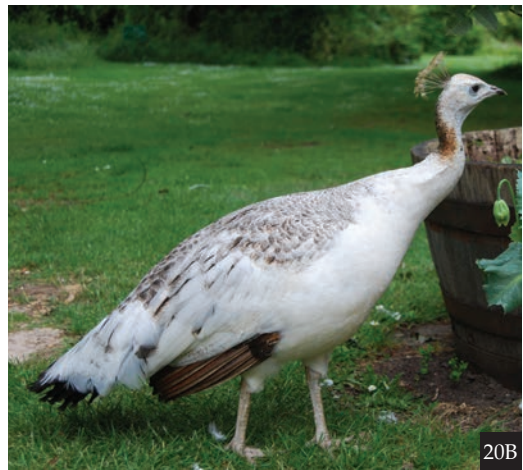
Figure 20. Normal-coloured and black-shouldered female Indian Peafowls Pavo cristatus ; the ‘black-shoulder’ mutation has a major effect on female plumage (Hein van Grouw)