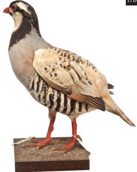
Figure 17. Chukar Alectoris chukar (NHMUK 1939.12.9.3715), same mutation as in Fig. 16.