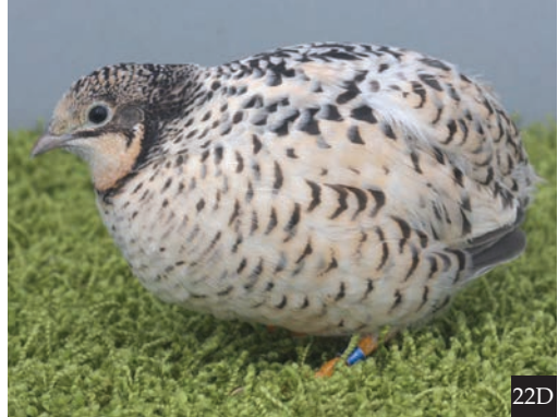
Figure 22. Forms of melanism (C and D) in Asian Blue Quail Synoicus chinensis that affect female plumage much more than male plumage (Pieter van den Hooven)