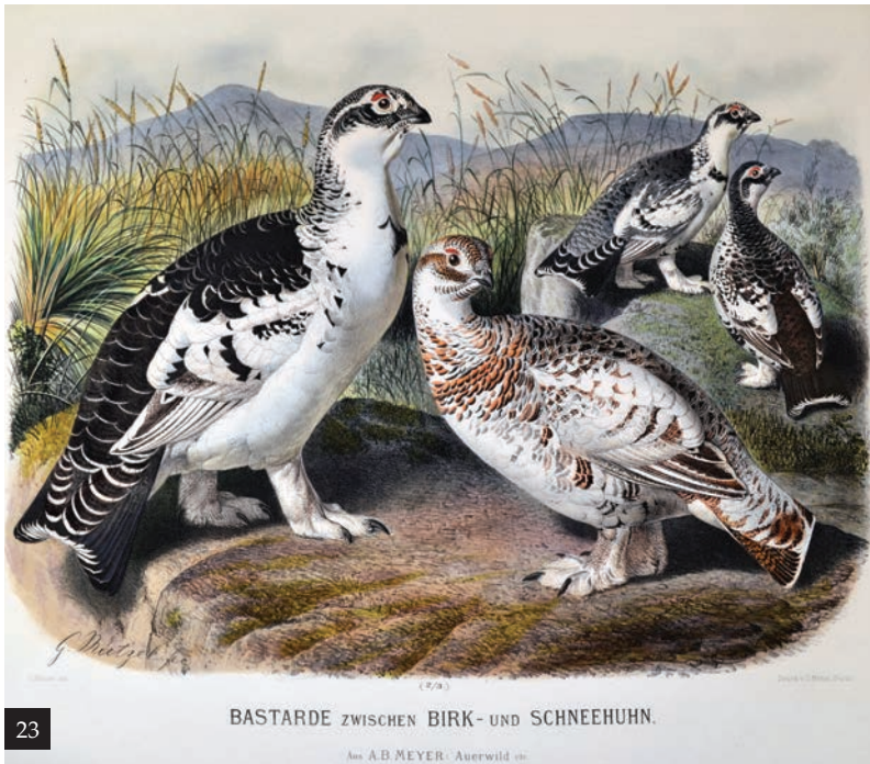
Figure 23. Pl. 14 in A. B. Meyer (1887) Unser Auer-, Rackel- und Birkwild und seine Abarten showing Black Grouse Lyrurus tetrix × ptarmigan Lagopus sp. hybrids