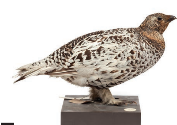
Figure 26. Another form of melanism in Black Grouse Lyrurus tetrix specimens at Zoological Research Museum Alexander Koenig, Bonn, which alters the pattern and markings, resulting in a paler appearance than normal; compare female with right-hand bird in Fig. 24.