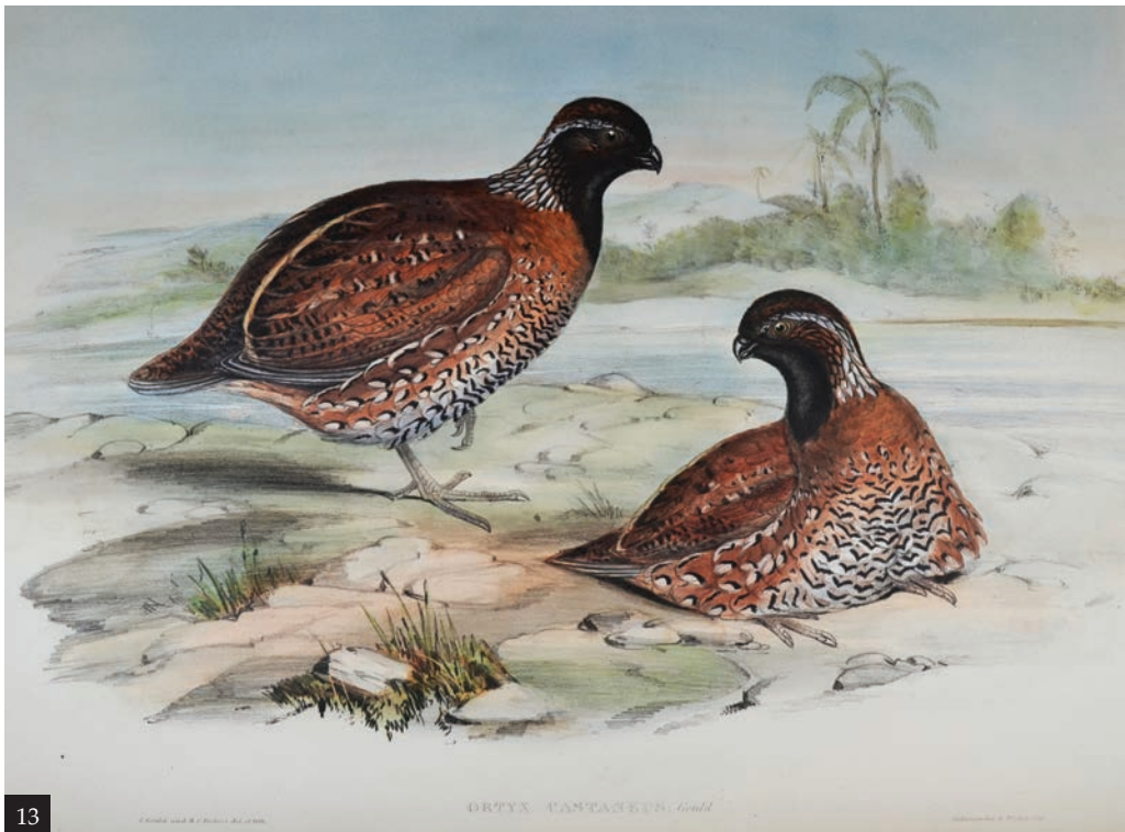
Figure 13. Gould's Chestnut-coloured Partridge Ortyx castanea , which was a melanistic Northern Bobwhite Colinus virginianus ; the normal black head markings have overrun their boundaries, whilst the rest of the plumage is darker as well, the latter mainly due to increased phaeomelanin hence 'Chestnut-coloured'

vineyard in the district of Shushov. After a careful examination of this specimen, I am now convinced that this Owl is a very good new species, differing from Syrnium aluco both in its general colour and character of markings...'. Although rare, melanistic Tawny Owls (Fig. 14A) are still occasionally recorded throughout Europe (and unconnected to the grey and rufous colour morphs of this species). In other Strix species, dark forms are also known and are less uncommon. In Ural Owl S. uralensis (Fig. 14B), for example, the melanistic form is often treated in the literature as a recognised morph.