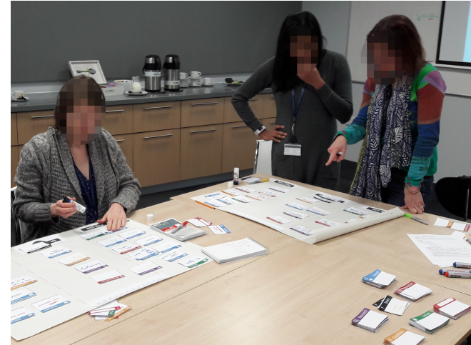
Figure 3: Staff at the Roslin Institute engage in a workshop.

In the Assembly Rooms our aim was to identify the pathways of influence and control that determine how different people have an impact upon material forms of energy use (e.g. lighting, insulation, electrical devices). Six workshops were held with 4-8 staff members in each, representing a cross-section of roles within the building. During the workshops individual staff members were initially asked to list five material factors within the building that contribute towards energy use and to select a) the factor that presented