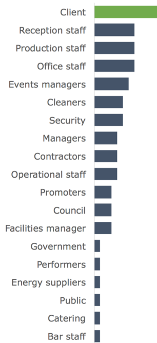
Figure 4: People most commonly identified in the workshops at the Assembly Rooms as having influence or control over lighting related energy use.