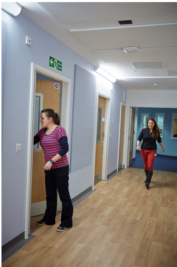
Figure 3 It can be difficult to find images of psychiatric inpatient spaces on many organisations’ websites.