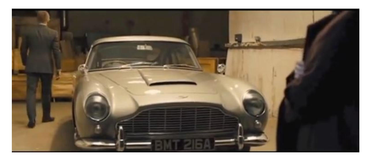
IMAGE 6: A guest appearance from the classic Bond car first seen in Goldfinger