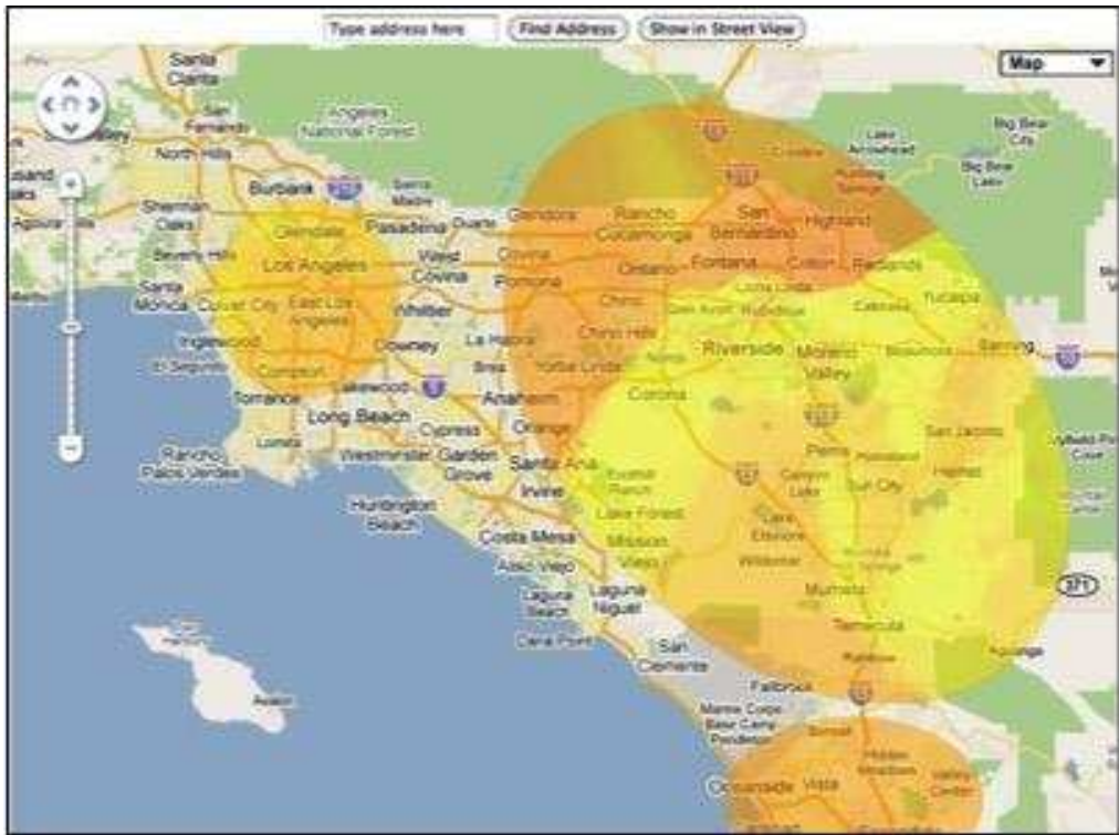
Figure 1: Underwriting engine "buy box" indicating areas to focus acquisition activity