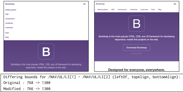
Figure 3: The original version of getbootstrap.com (top-left), the incrementally modified version (top-right), and a snippet of the report produced by REDECHECK (bottom).

To investigate the prevalence of the five common types of RLFs in real-world web pages and evaluate REDECHECK’s ability to detect them, we ran the tool on a corpus of 26 randomly collected web pages of varying complexity and domain. REDECHECK found RLFs of all five common types. Well over half of the web pages, including well-known ones such as Duolingo and Consumer Reports , contained RLFs [18]. Since these pages were all in production use and, we surmise, already subject to extensive testing, this result emphasises the importance and real-world relevance of the presented tool, further underscoring the benefits of using REDECHECK’s automated layout checkers. This empirical study also revealed that REDECHECK outperformed several spotchecking approaches. For instance, a manual spotcheck missed Duolingo ’s layout failure, as highlighted in Figure 1, illustrating the error-prone nature of current industrial quality assurance practices for responsive pages.