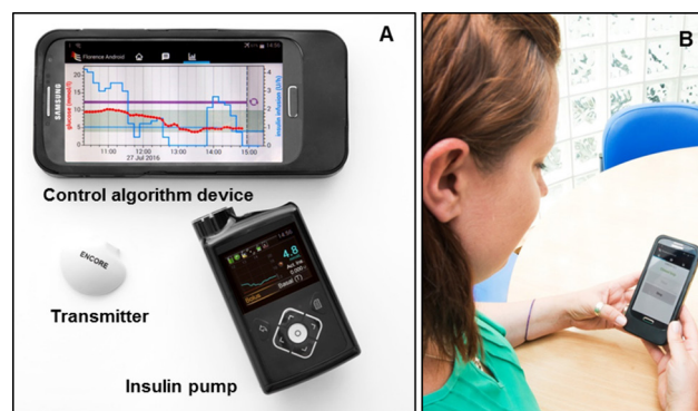
Figure 2 Closed-loop system prototype. (A) Components of the FlorenceM closed-loop system consist of a continuous glucose monitoring (CGM) transmitter with Enlite 3 sensor, an insulin pump (modified 640G pump) integrated with the CGM receiver and a mobile phone running the control algorithm. (B) A photo of a participant (obtained with consent) using the closed-loop system.

the study insulin pump. Calculations use a compartment model of glucose kinetics describing the effect of rapid-acting insulin analogues and the carbohydrate content of meals on glucose levels. 20 The control algorithm will be initialised using preprogrammed basal insulin delivery downloaded from the study pump. In addition, information about participants' weight and total daily insulin dose will be entered at setup. During closed-loop operation, the algorithm adapts itself to a particular participant. The treat-to-target control algorithm aims to achieve a default