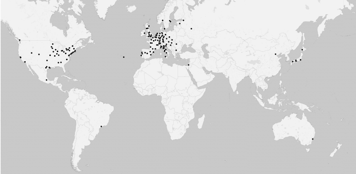
Map 1. Worldwide Locations of the 1543 Editions of the Fabrica. Each dot represents one city regardless of the numbers copies are held there.