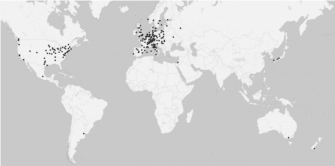
Map 2. Worldwide Locations of the 1555 Editions of the Fabrica. Each dot represents one city regardless of the numbers copies are held there.