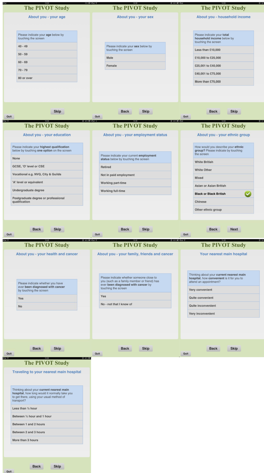
Fig. 3 Screen shots showing questions about participant characteristics