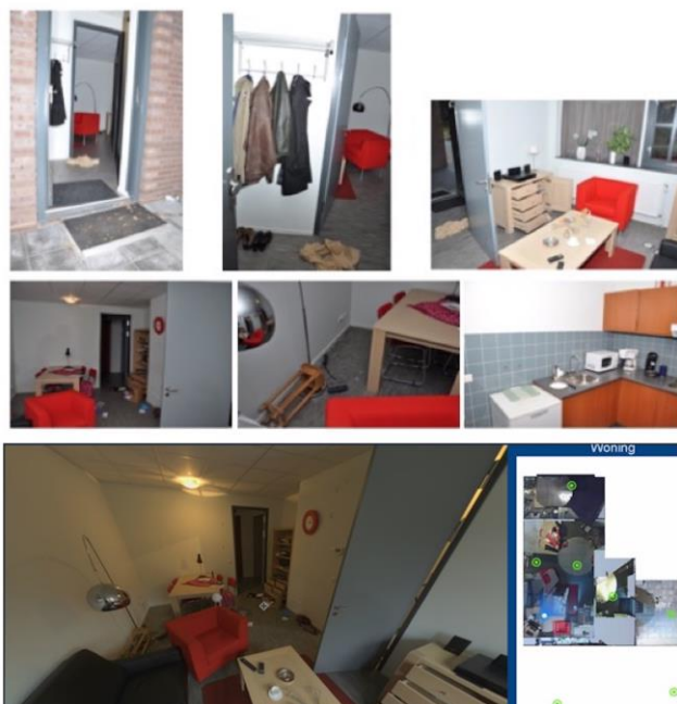
Figure 1: photos of the scene of the crime. The bottom photo on the left shows the outlook of the scene on the computer, the picture on the bottom right shows the plan of the house from a view from above. The green dots can be clicked on to view the house from another angle.

and out. In addition, participants were provided more detailed photographs of the scene on paper. Figure 1 shows photos of the scene and the outlook of the panoramic scene on the computer.