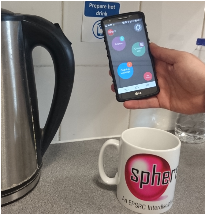
Fig. 1. Logging 'prepare hot drink' with the hybrid app (NFC tag in the background).

Semantic matching is performed across all logging modes, which means NFC-logged activities will show up in the location-based screen. The Ongoing activities button has a counter over it to indicate the number of activities being logged through any of the available modes. By clicking on this button the user can select an item from the list, edit its details, delete it or terminate it. Terminated activities are moved from Ongoing activities to My history . Alternatively, through the settings cog, the user can terminate all ongoing activities with a single button press if, for example, a user leaves the house. Users can manually edit any entry and can create additional activities under each location. With this app, we aimed to meet the following requirements: