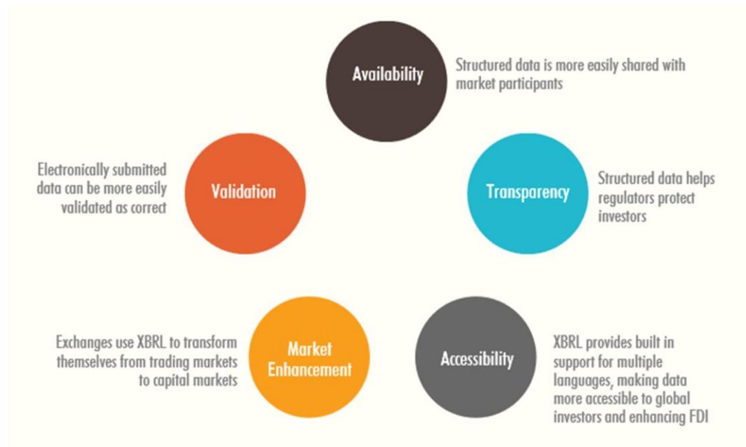
Figure 2 - Benefits of XBRL (XBRL International, 2016)

(for mandatory reporting schemes) or may (for voluntary reporting initiatives) prepare and publish the necessary XBRL reports. The report can be for multiple recipients: the corporate website, an official reporting platform, a data repository, etc. Once the data is generated in XBRL, business facts are more accessible for any kind of data analysis application, and enable all users to make easy and fast calculations, rankings, benchmarks, and comparisons. The reporting entity itself can also benefit from this digital format for management, consolidation or internal auditing purposes (Figure 2).