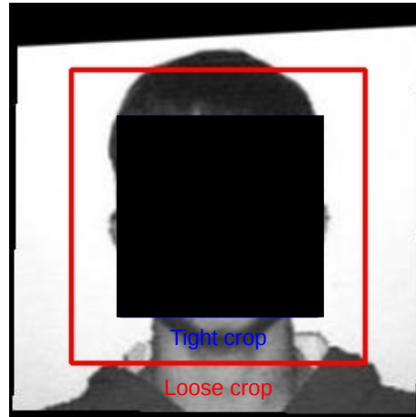
Fig. 1. An example of a tightly cropped face from the LFW dataset, along with the additional information we can capture by using a larger bounding box. (left, each face image is resized to 40 by 40 and 256 by 256 pixels for different experiment settings)

This was performed since the new face detector has been shown to outperform the VJ algorithm, increasing the number of face detections on the weakly labelled data, therefore allowing for more images to be kept in the training set. In total, we used 5,286,130 face images from the original weakly labelled data in Section III-A for training our networks in this experiment.