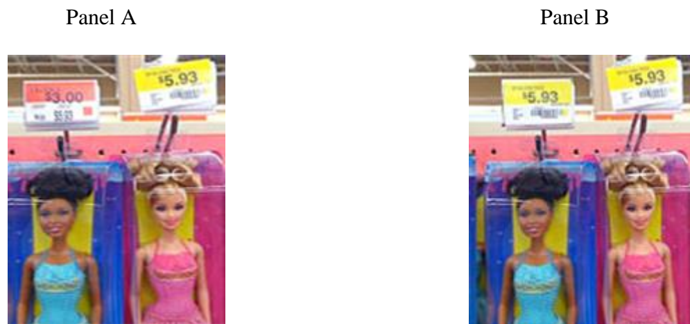
Figure 1. Example of the memes included in the study. Panel A depicts a racial themed meme and Panel B depicts the comparable non-racial themed meme.

To assess perceptions of the memes, participants were presented with a single image and asked to rate how comfortable (reverse scored), acceptable (reverse scored), offensive, hurtful, and annoying the image was on a 7-point Likert scale ranging from 1 (Strongly Disagree) to 7 (Strongly Agree). In total, participants rated 10 images (five racial themed and five non-racial themed control memes) that were presented in random order. Responses were averaged to create