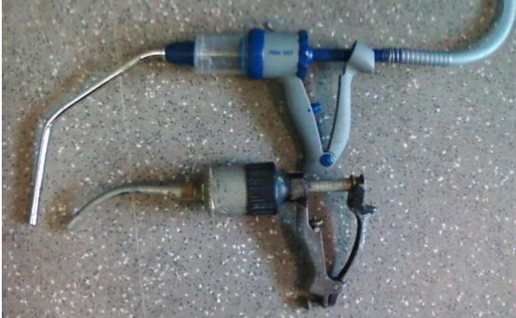
Figure 1 Farm 1 New gun (top) - longer barrel with more acute angle

Drenching gun injuries are well recognised in sheep and have been clearly shown to pose a threat to the health and welfare of sheep in the UK (Harwood and Hepple 2011). In cattle liver fluke infection is associated with the widespread use of anthelmintic products to reduce the impact of infestation on production, particularly in dairy cattle (Howell and others 2015). We wish to report on three cases of dosing gun injury, with fatal outcome, for three dairy farms where cattle were treated for liver fluke.