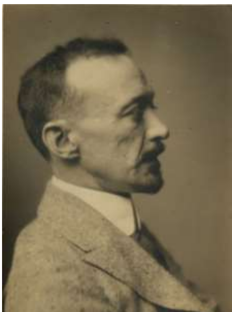
Fig. 1 W. Adolphe Roberts in 1917. W. Adolphe Roberts Papers. National Library of Jamaica MS353.6.1. With kind permission of the National Library of Jamaica.