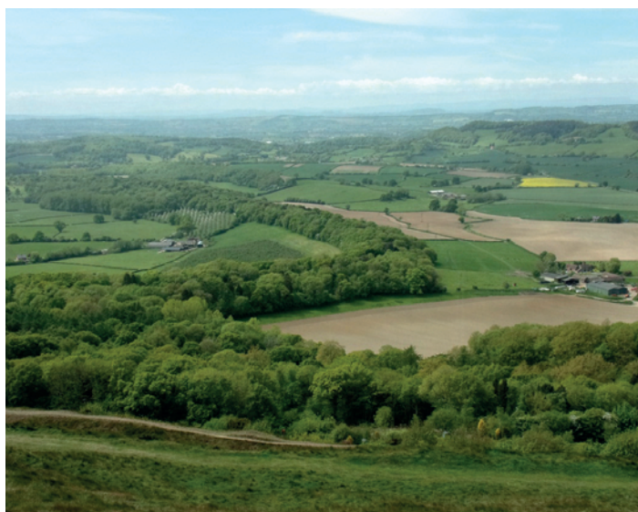
Figure 1. Many parts of lowland England, for example Herefordshire, have an agroforestry landscape.

records multiple land use) to determine the extent of agroforestry in each European country. For the UK they calculated that multifunctional land use involving trees with either grazing or crops occupies about 552,000ha, i.e. similar to the area of oilseed rape (650,000ha). Petit et al. (2003) also report that there are 468,000km of hedgerows in Great Britain with an additional 138,700km comprising lines of trees and shrubs.