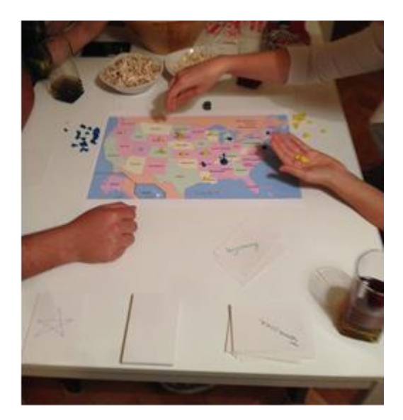
Figure 3: Focus Group #4 - Second Session

Press Start ISSN: 2055-8198 URL: http://press-start.gla.ac.uk