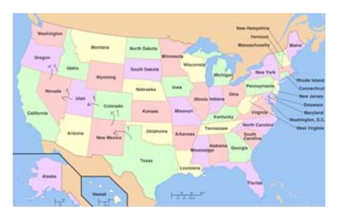
Figure 1. Basic Mechanic – Move of a Player from Texas to Oregon with 5 Action Points (Adapted from MissMJ (2011)).

states (from Texas to Oregon in Figure 1). If a territory is occupied by the opponent, one spends two action points to claim that area and march on. If the player has already claimed bunch of territories adjacent to each other, s/he uses only one action point to go through her own territories. In the second scenario, the player may decide to select the state to march on or select the "Draw a Blue Star" card to draw from the BlueStar deck. In the last scenario, the player has to select a "Draw a Blue Star" card instead of marching and draws a card from the BlueStar deck.