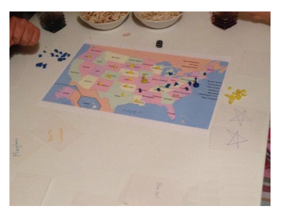
Figure 2: Focus Group #4 – First Session

In the first play session, six cards were being opened for a player per turn where s/he could choose one of the three to march on (at the stage three of the game) after the opponent discards three of them. The first idea was to make the game as strategic as possible by also including the opponent in the turn even if that turn is not the her turn. However, after inspecting the game play and feedbacks, it has been determined that too much information is being presented to players at a turn therefore, that design decision was changed to opening of two cards without the intervention of the opponent.