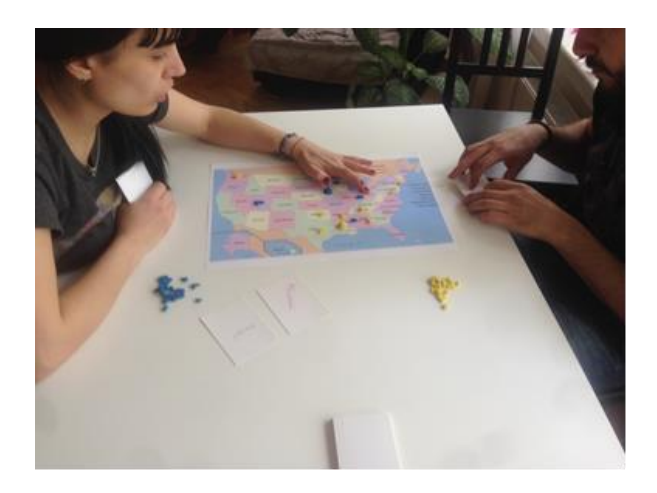
Figure 4: Focus Group #5