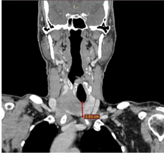
Fig.3. Coronal scan showing measurement of superoinferior diameter of thyroid isthmus