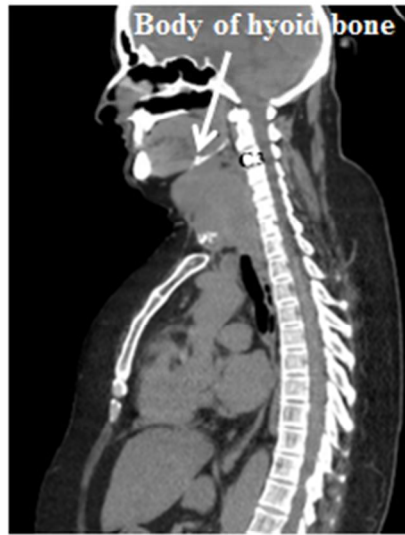
Fig.2. White arrow in sagittal scan showing vertebral level of body of hyoid bone