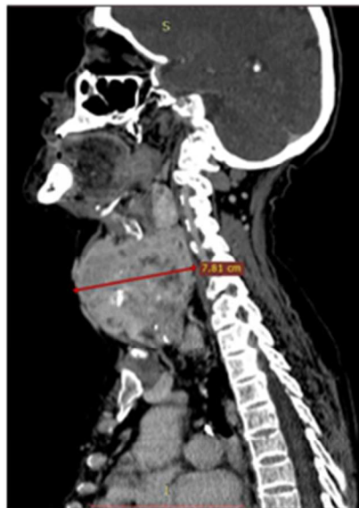
Fig.1. Sagittal scan showing measurement of anteroposterior diameter of thyroid mass