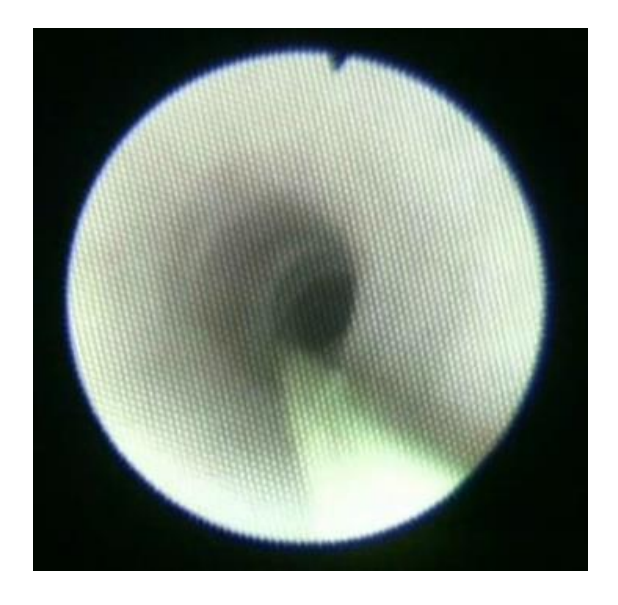
Figure 2. Left mid-ureter in Thiel cadaver, guidewire in situ.