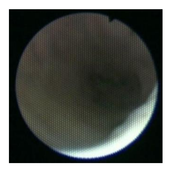
Figure 3. Left renal pelvis from pelvic-ureteric junction.