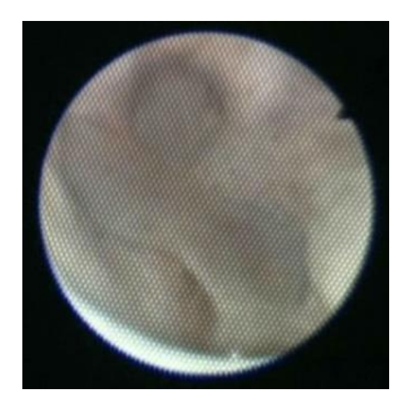
Figure 4. Cadaveric renal pelvis.