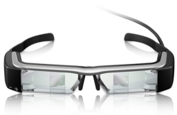
Figure 3. The EPSON Moverio BT-200, from [6].

the projection display is situated on upper right lens, requiring students to shift their eyes between visual sources. Students did not think this improved problems of visual dispersion. Therefore, for a more formal pilot, we switched devices to the EPSON Moverio BT-200 (Figure 3), which provides the display straight ahead, allowing viewing of both the projected information and the room without a physical shift.