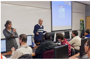
Figure 1: This image shows a mainstream computing class at RIT. Both hearing and DHH students attend the class. As shown, the professor is speaking the classroom lecture, using slides (on the right) as part of the presentation. An ASL interpreter (on the left) provides accessibility support for DHH students.