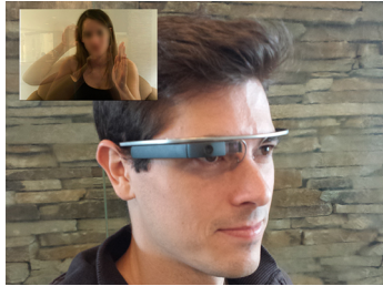
Figure 2: Informal testing involved use of Google Glass. Note that video projection of ASL or captions is onto the Glass display in the upper right for users.