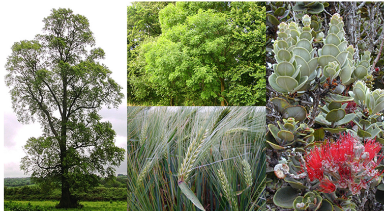
Fig. 1. Examples of species affected by EPPs. Clockwise from left: English Elm ( Ulmus minor ), decimated by the “Dutch Elm disease” pathogen, Ophiostoma novo-ulmi ; European Ash ( Fraxinus excelsior), under threat from “Ash dieback” caused by Hymenoscyphus fraxineus ; Ōhi’a ( Metrosideros polymorpha), threatened by “Rapid Ōhi’a death” due to Cerasystis frimbriata and barley ( Hordeum vulgare), the host of Ramularia collo-cygni

In response to these changes in climate and their direct and indirect effects on crops and their pathogens, new crop varieties may be developed. This process currently takes around 20 years on average [23], however, so that while adaptation is possible it may be outpaced by continuing, rapid change.