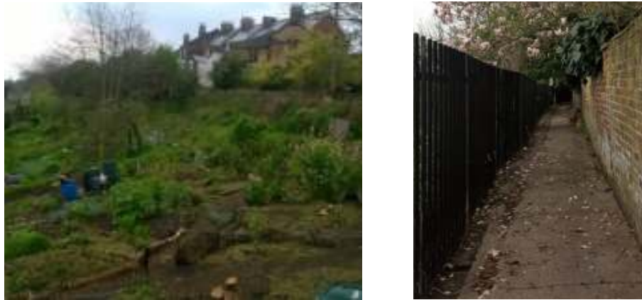
Fig. 1. The pilot project allotments, adjacent row of houses and Highways adopted footpath situated between the two

To develop the conceptual stages of the runoff sharing enterprise and initiate the participative aspects, a pilot project was established ('the pilot'), funded by a specialist social enterprise funding organisation. The pilot enabled experiential learning and co-creation to form the foundation of the enterprise from the very beginning. In the interests of anonymity regarding the community groups and organisations embedded in the pilot, generic descriptive names are utilized herein, rather than their actual names and names and locations are omitted from all Figures. In early 2015, conversations were held with several residents near and users of an allotment site illustrated in Figure 1.